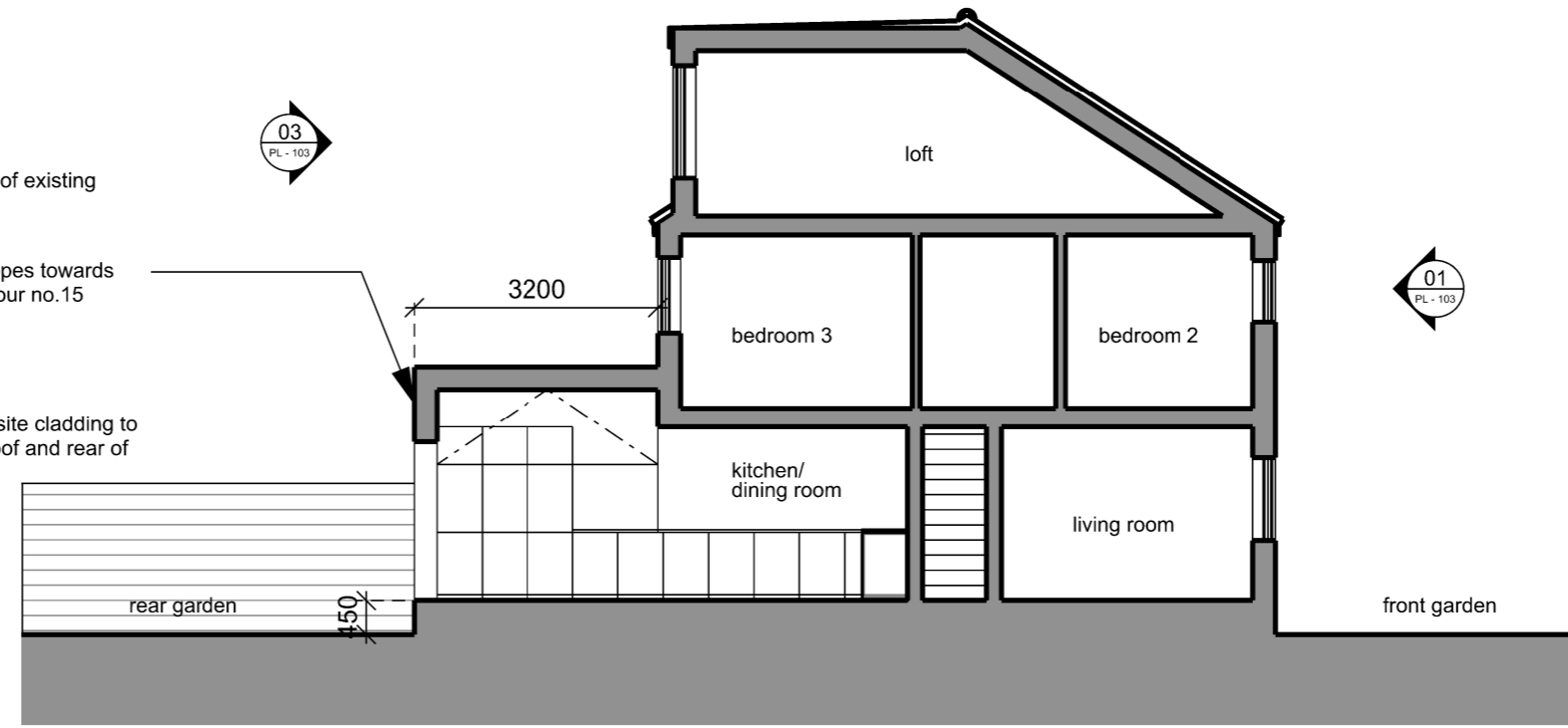
02 Section AA scale 1:100 @ A3