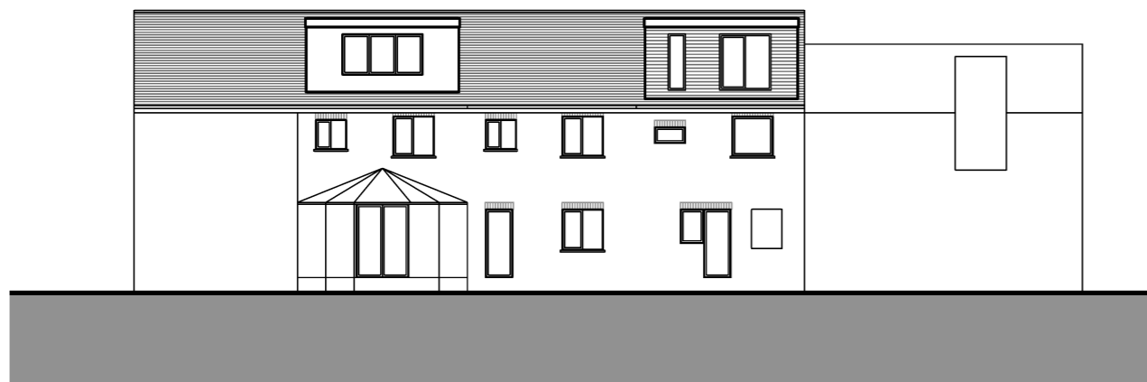
02 Rear Context Elevation scale 1:200 @ A3