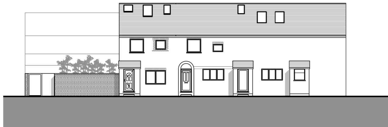
01 Front Context Elevation scale 1:200 @ A3