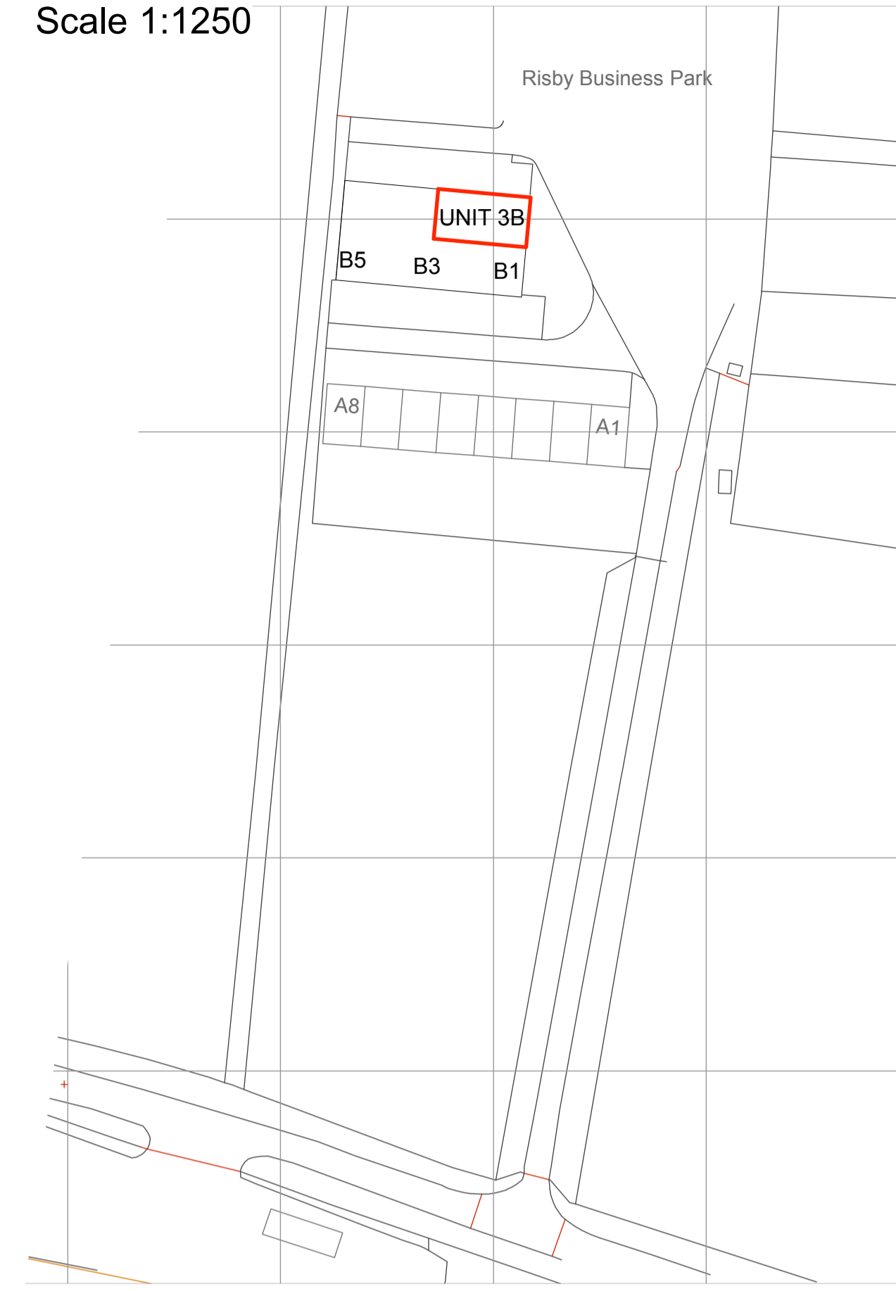
SITE LOCATION Scale 1:1250

NOTE DO NOT SCALE THIS DRAWING - USE DIMENSIONS The Contractor is to check and verify all dimensions on site before starting work and report any omissions or errors. This drawing is to be read in conjunction with all relevant consultants and specialists drawings. This Drawing is Copyright This drawing is issued for the sole and exclusive use of the named recipient. Distribution to any third party is on the strict understanding that no liability is accepted by Thurlow Architects for any discrepancies, errors or omissions that may be present, and no guarantee is offered as to the accuracy of information shown.