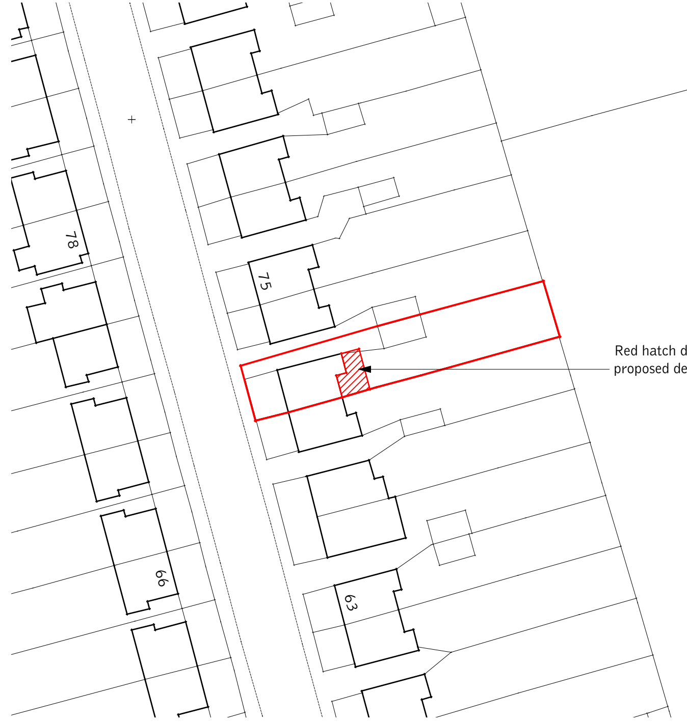
2 Block Plan Scale: 1:500