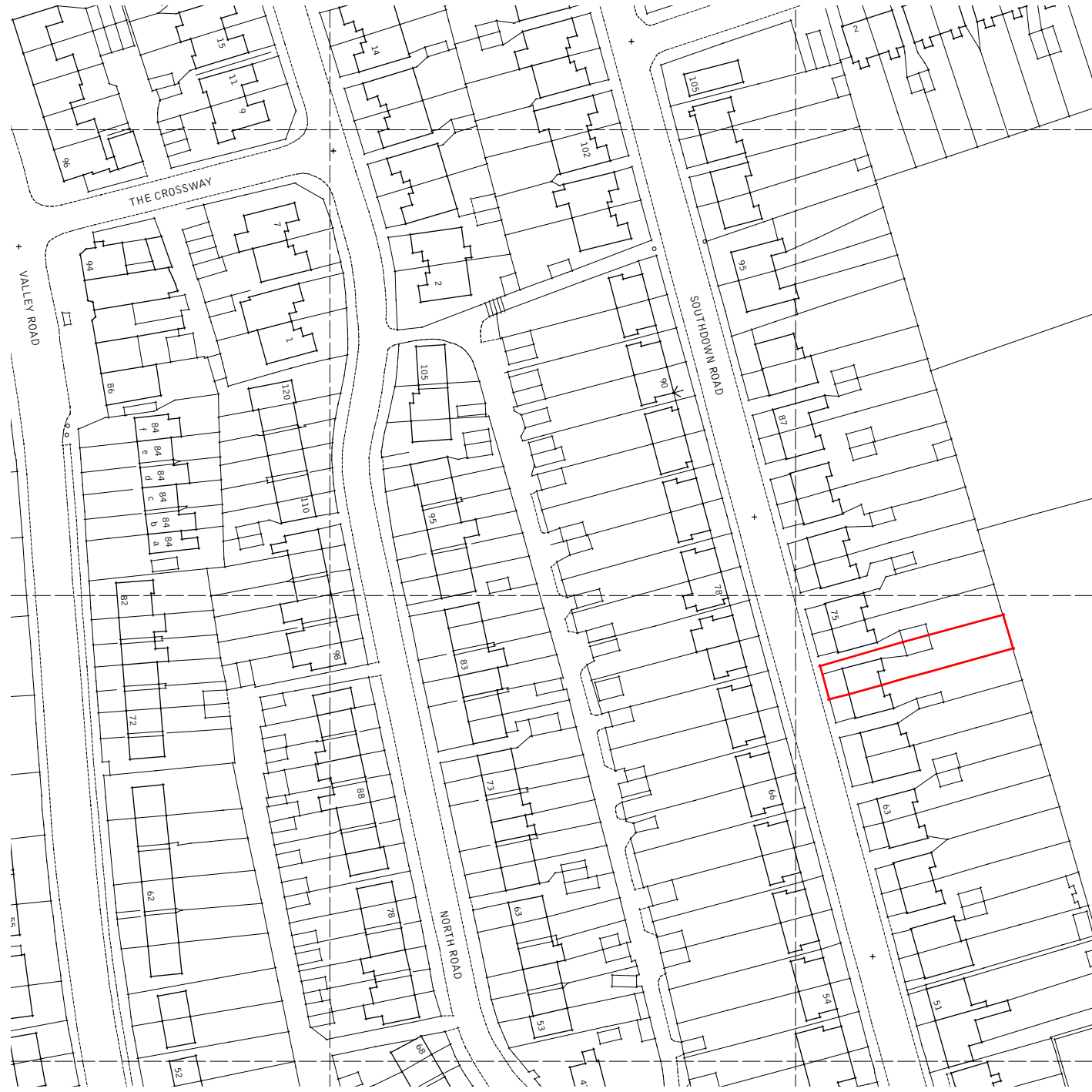
1 Site Location Plan Scale: 1:1250