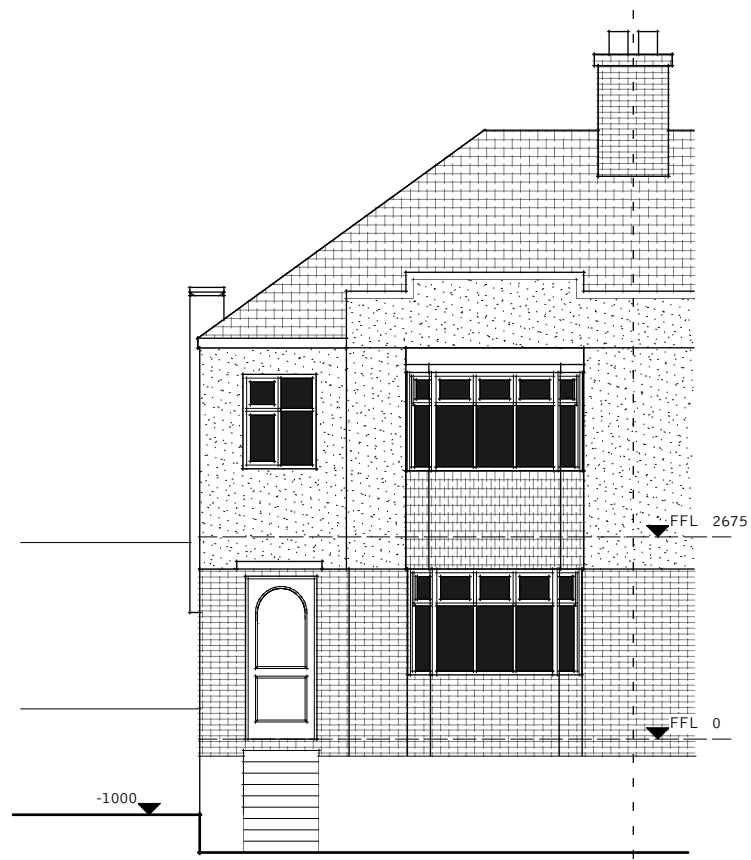
1 Front (west facing) elevation Scale: 1:100 (no change) 0 1 2 3 4 5 M