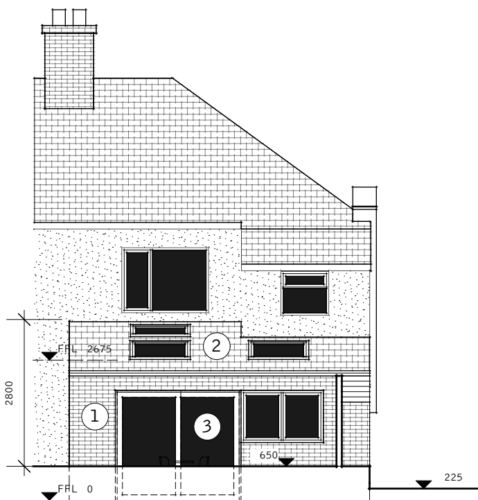
3 Rear (east facing) elevation Scale: 1:100