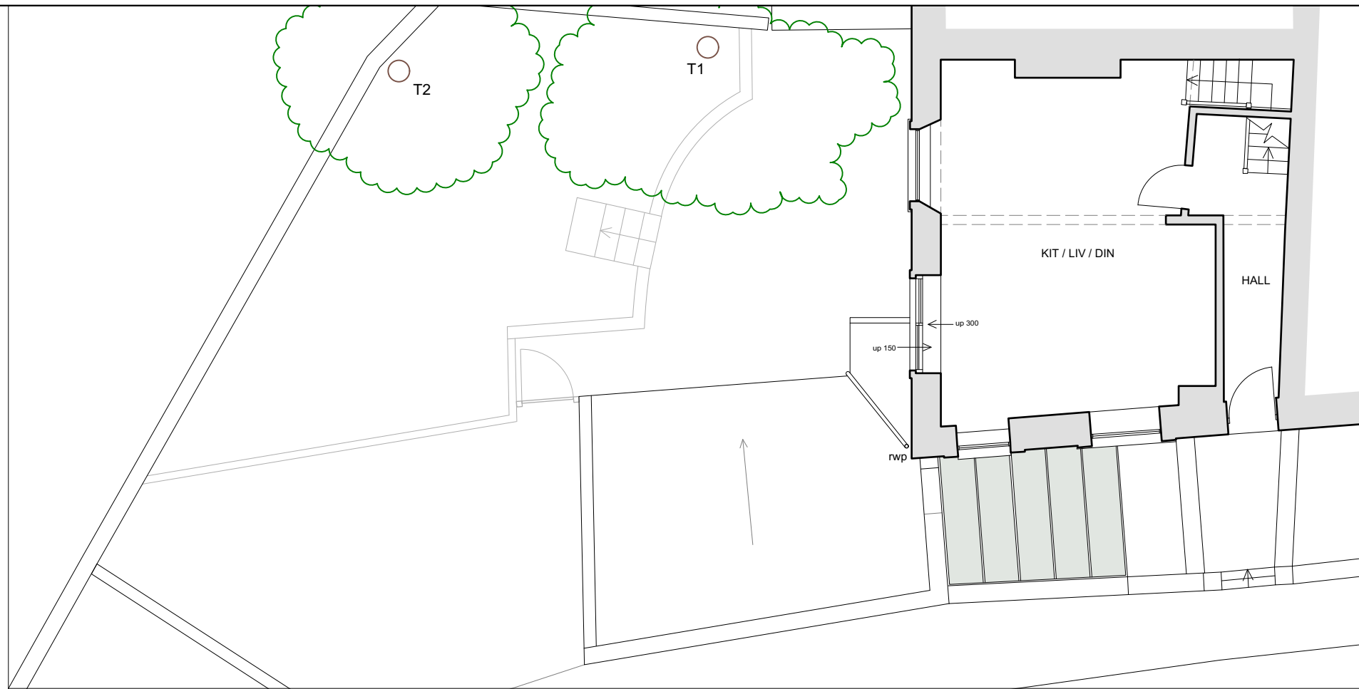
02 Existing ground floor plan 1:100 @ A3