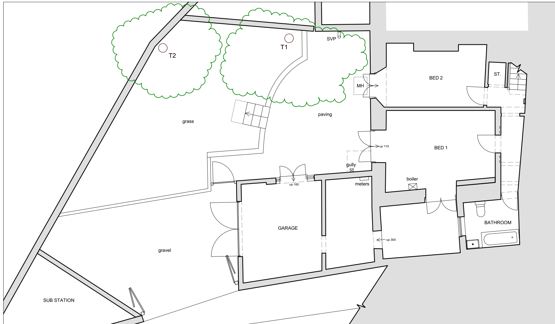
01 Existing lower ground floor plan 1:100 @ A3

General Notes DO NOT SCALE. All dimensions must be checked on site, errors are to be reported. All illustrated material is subject to copyright. Unless otherwise agreed in writing, all rights to use this document are subject to payment of all Architect's charges. This document may only be used for the express purpose and project for which it has been created and delivered, as notified in writing by the Architect. This document may not be otherwise used or copied. Any unauthorised use of this document is at the user's sole risk and without limiting the Architect's rights the user releases and indemnifies the Architect from and against all loss so arising.