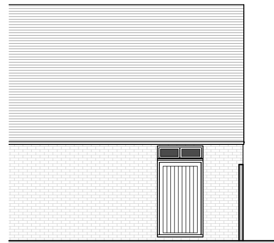
3 p102 07.0 south elevation - existing 1 : 100