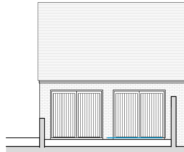
2 p102 06.0 north elevation - existing 1 : 100