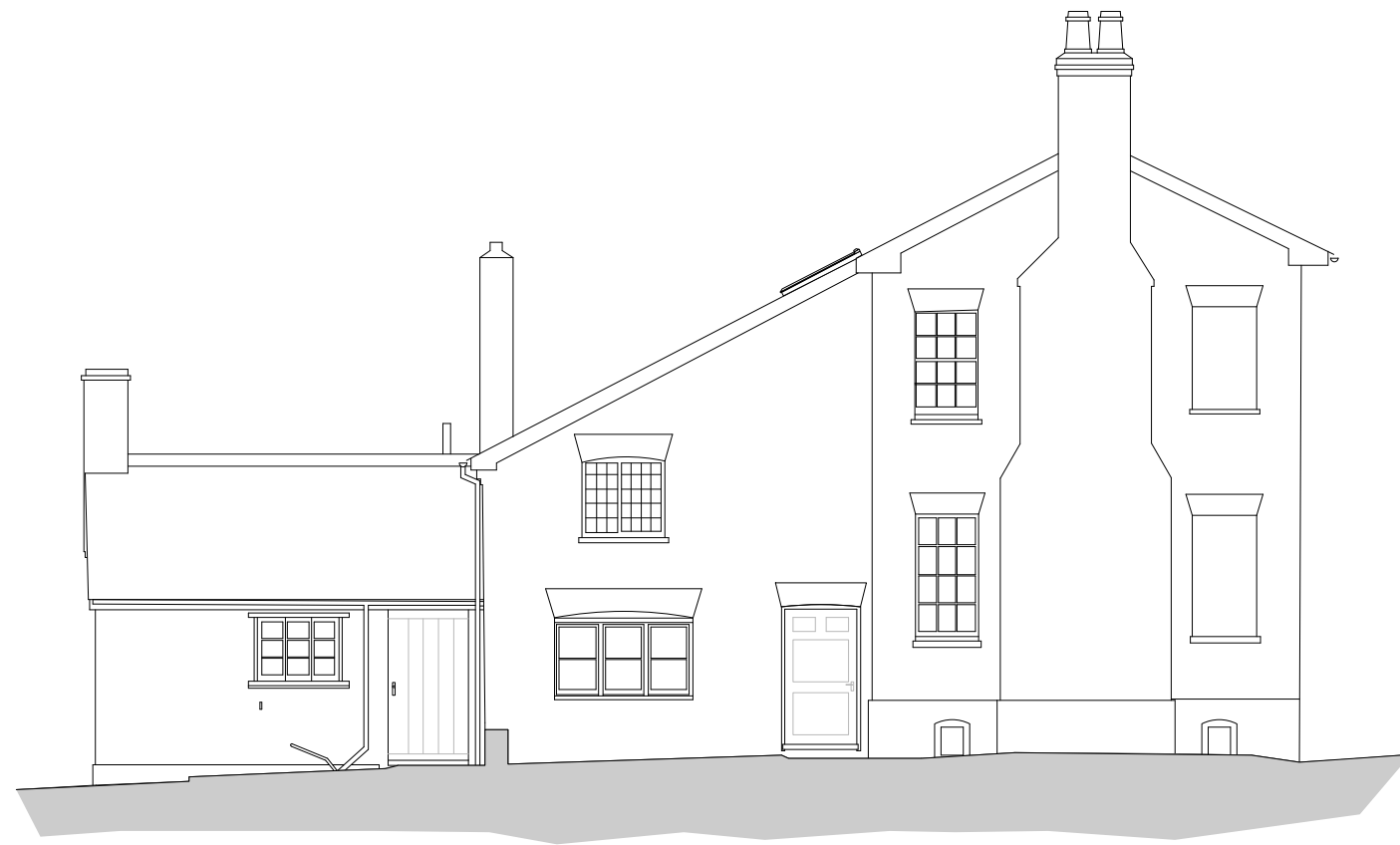
Existing North West Elevation