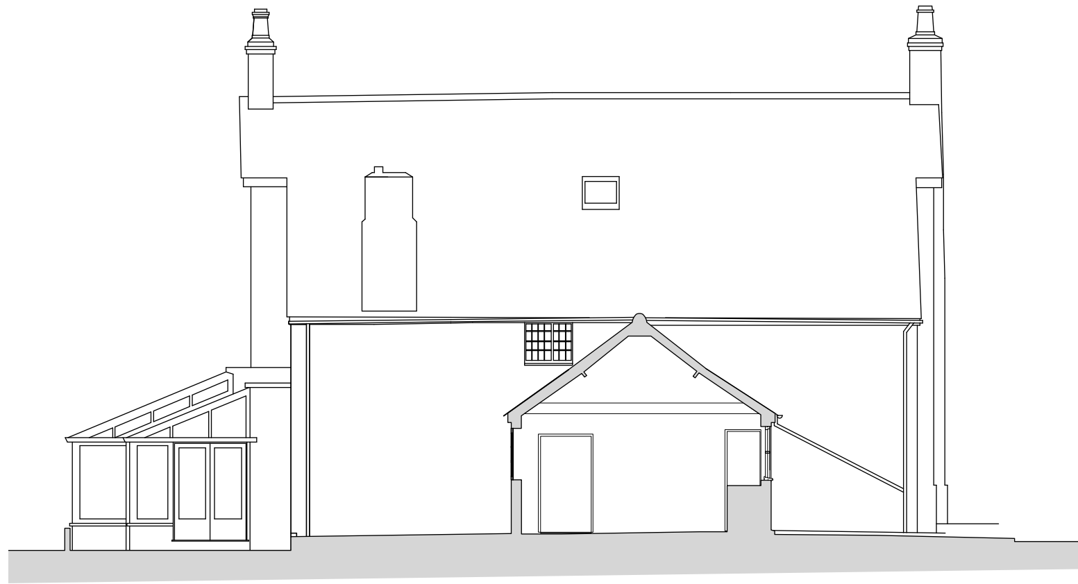
Existing Section CC