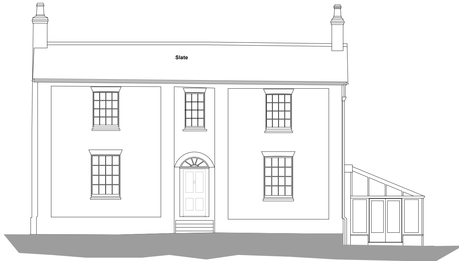
Existing South West Elevation