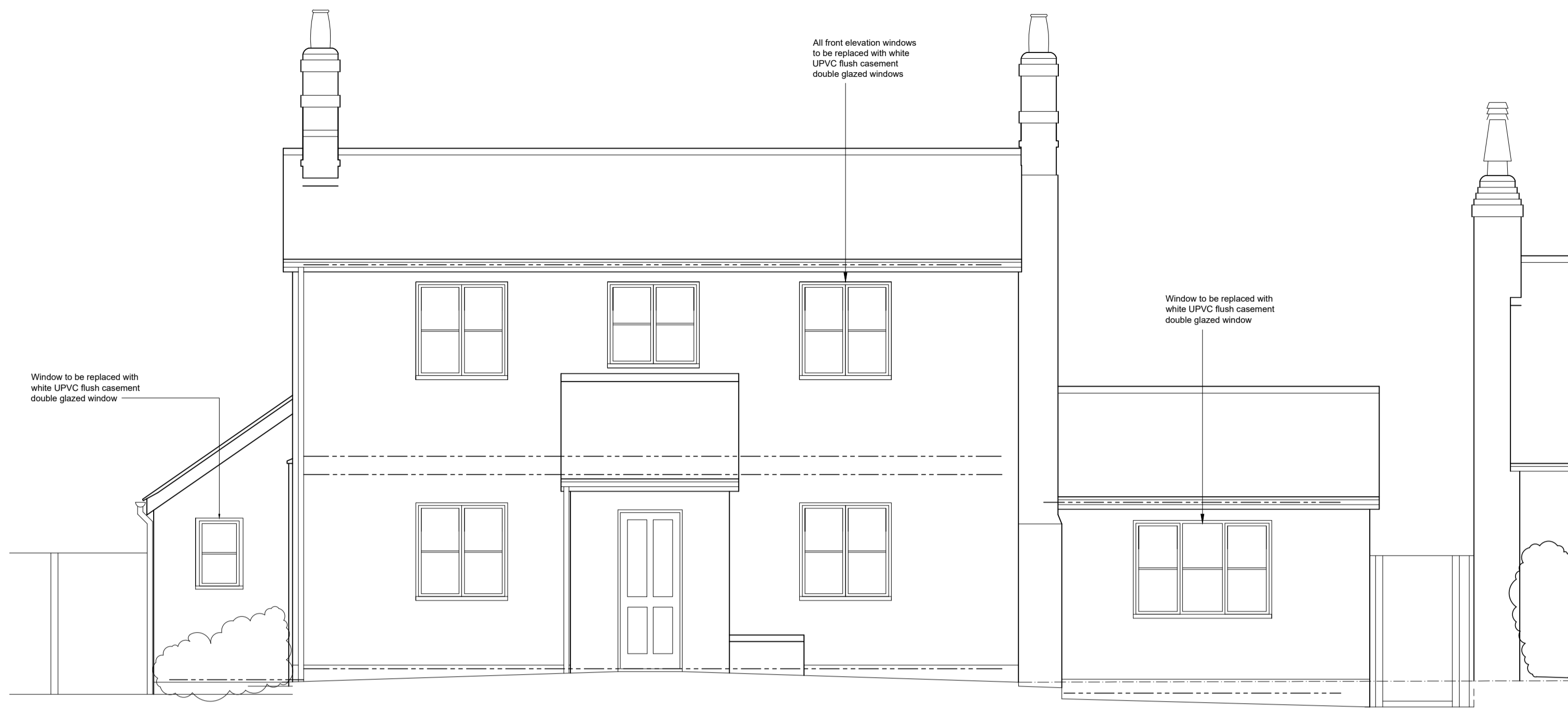
Proposed East Elevation