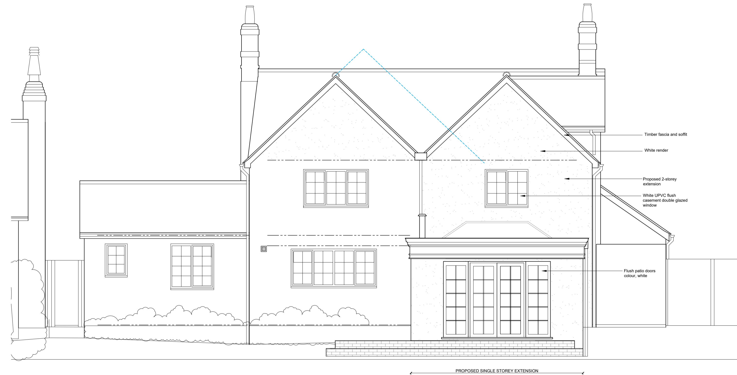
Proposed West Elevation