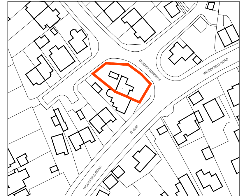
Area Plan Sc 1:1250

© THIS DRAWING AND THE BUILDING WORKS ILLUSTRATED ARE COPYRIGHT AND MAY NOT BE REPRODUCED WITHOUT WRITTEN PERMISSION