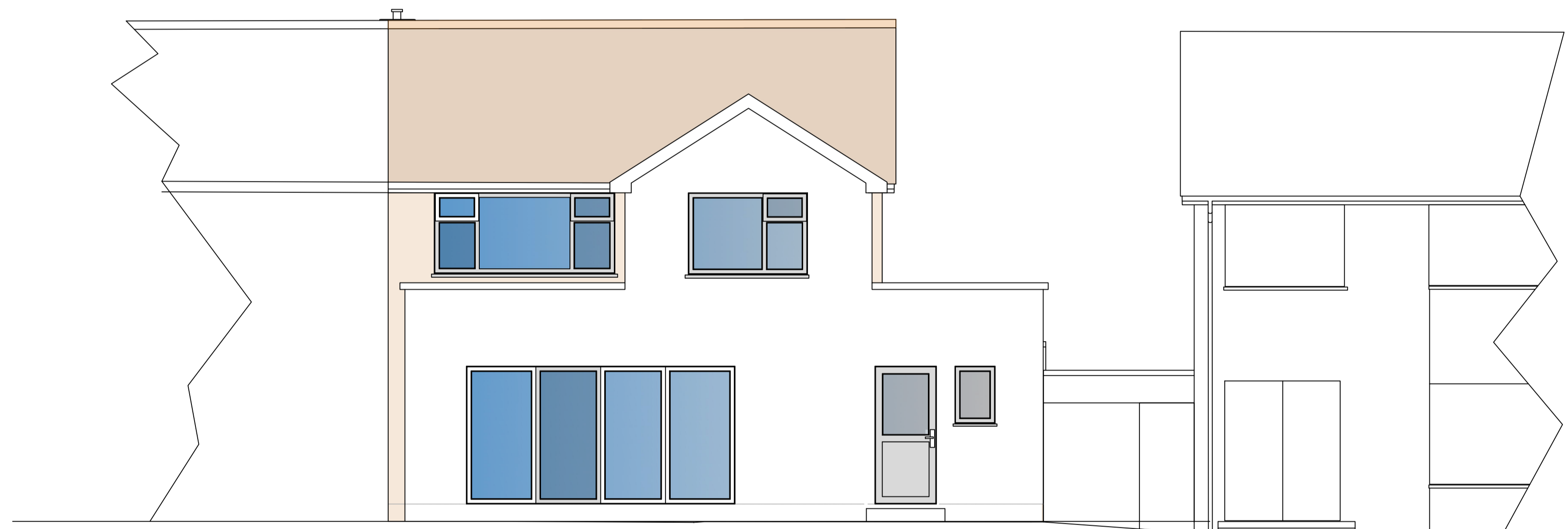
PROPOSED NORTHERN ELEVATION (Rear) @ 1:50