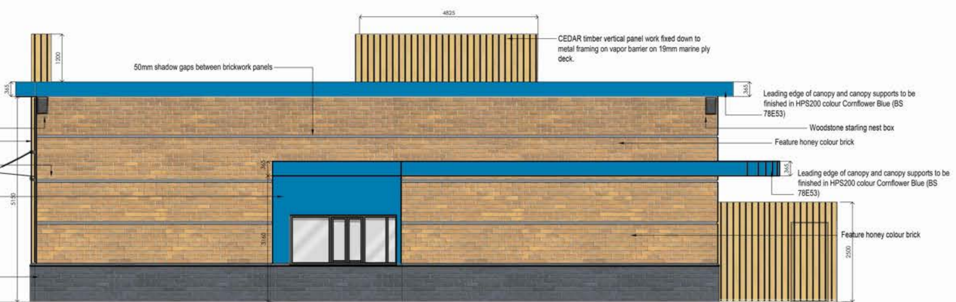
DRIVE THRU SIDE ELEVATION