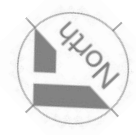
EXISTING BLOCK PLAN 1:200