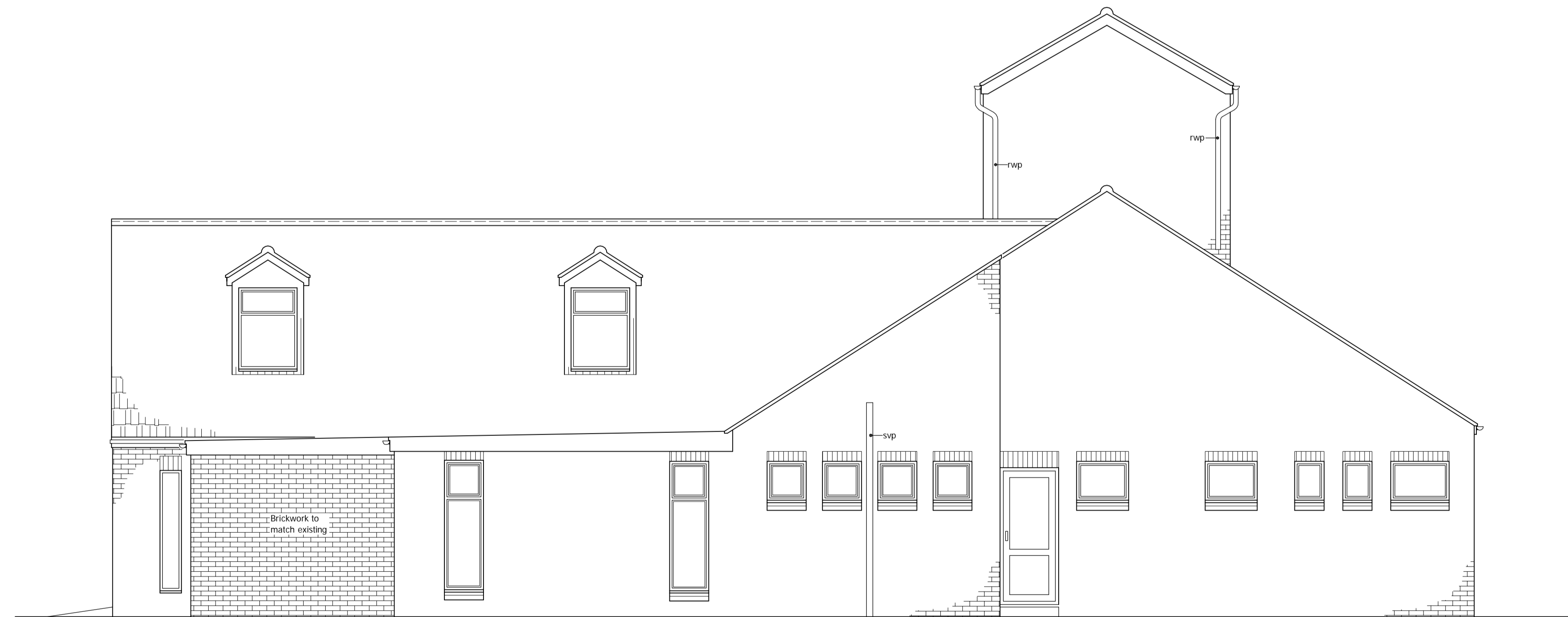
PROPOSED Adj. SIDE ELEVATION scale 1:50