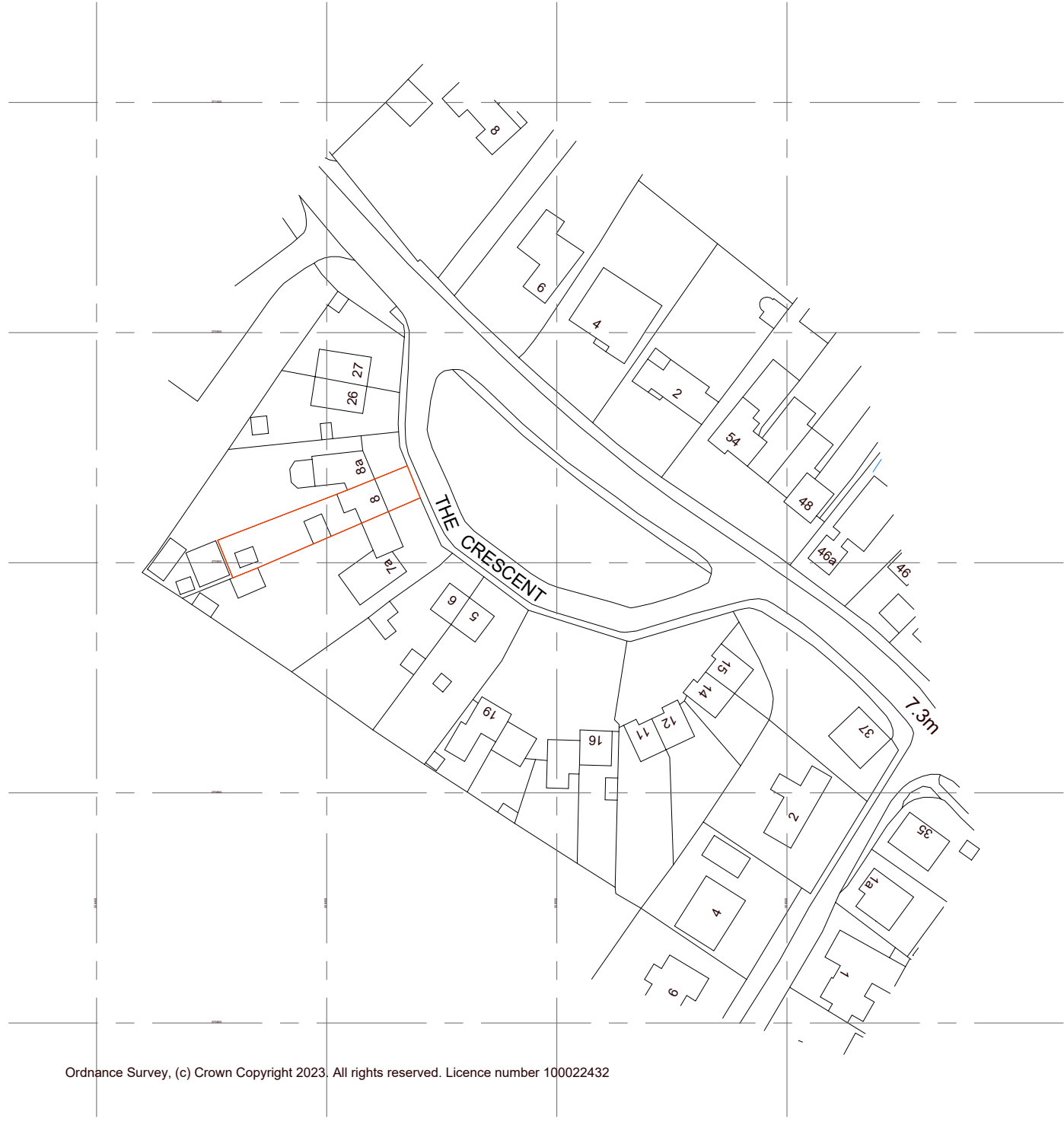
3 Location Plan 1 : 1250 0m 25m 50m 75m 100m 125m VISUAL SCALE 1:1250 @ A1

General Notes: Do not scale from these drawings. The Contractor is responsible for checking all dimensions on site prior to commencement of the works with any errors being reported to The Ely Planning Company Ltd as soon as possible. Any construction work carried out prior to receiving all necessary approvals is entirely at the householders' clients risk. All building work to be carried out to the satisfaction of the Local Authority Building Control Officer and in accordance with the current Building Regulations and as such additional unforeseen building works may be required on site. The Contractor shall inspect all adjoining properties which may be affected by the works prior to commencement of works and record and report with the owner any defects. The Contractor shall be entirely responsible for the security, strength and stability of the building during the course of the works. Drawings produced for the purpose of obtaining Building Regulations approvals only and do not constitute full working drawings. All drawings are the copyright of The Ely Planning Company Ltd. This drawing may not be copied by any third parties without prior permission.