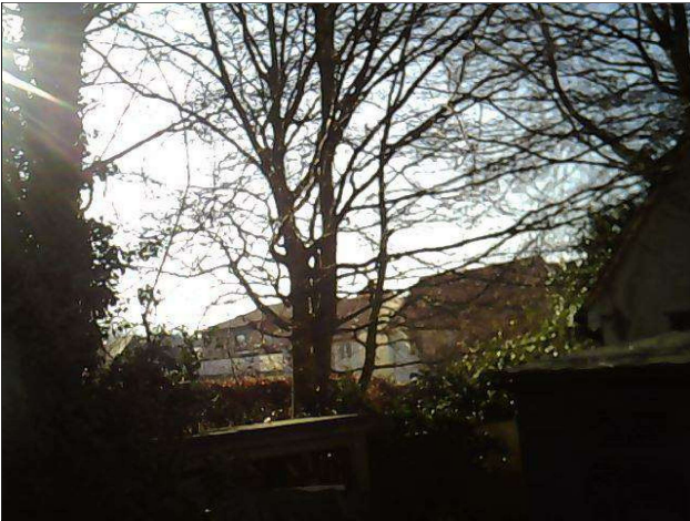
T3 - Hornbeam