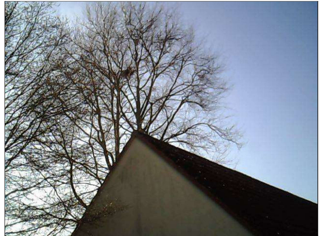
T4 - Beech