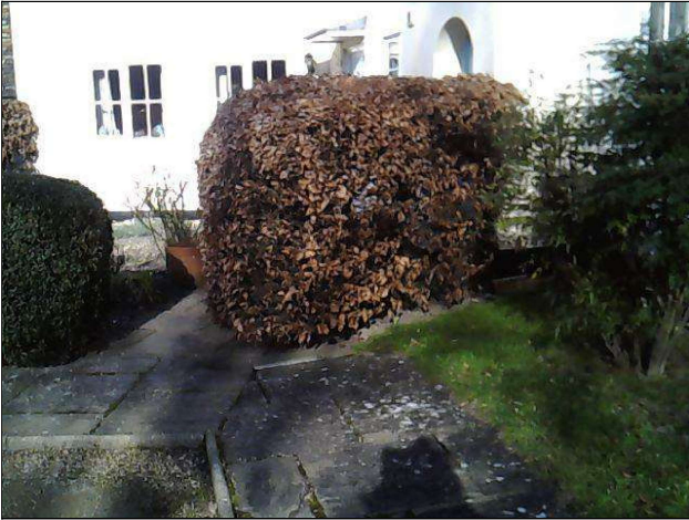
H1 - Beech