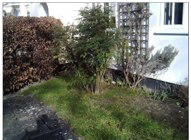
S1 - Shrub