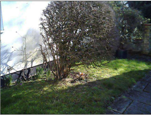
S2 - Dogwood