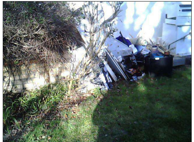
S4 - Buddleia