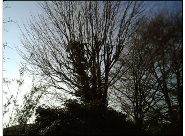
View looking towards T1, T2 & T3