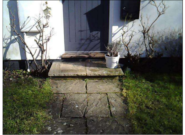
SG1 - Rose