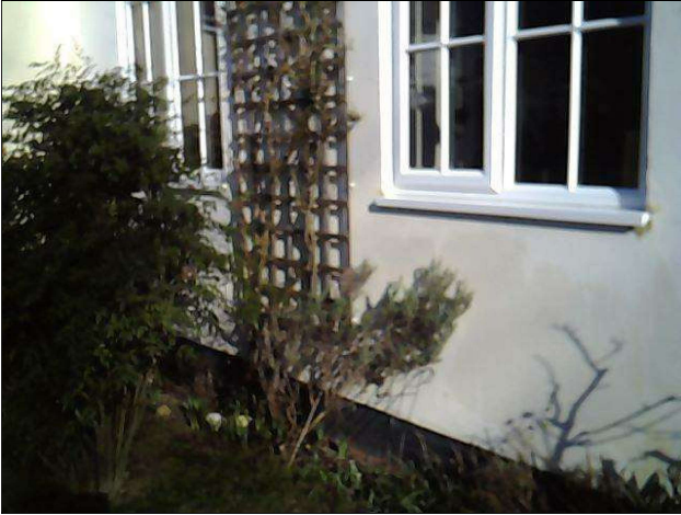
C1 - Rose