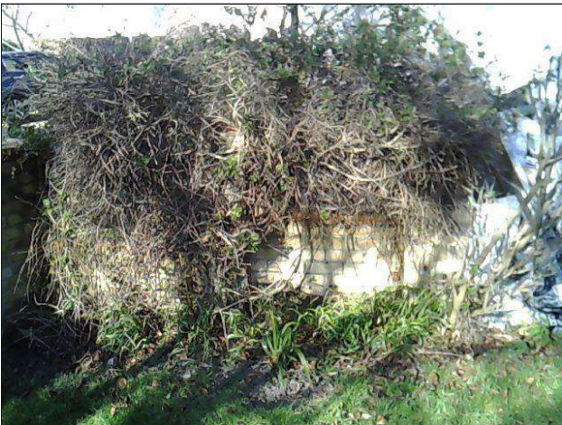
C2 - Lonicera