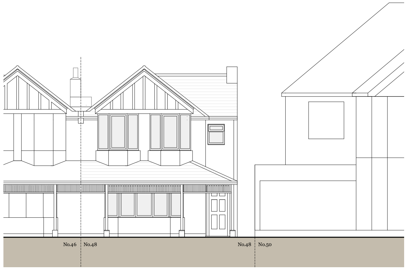
Front ⊟evation (east)