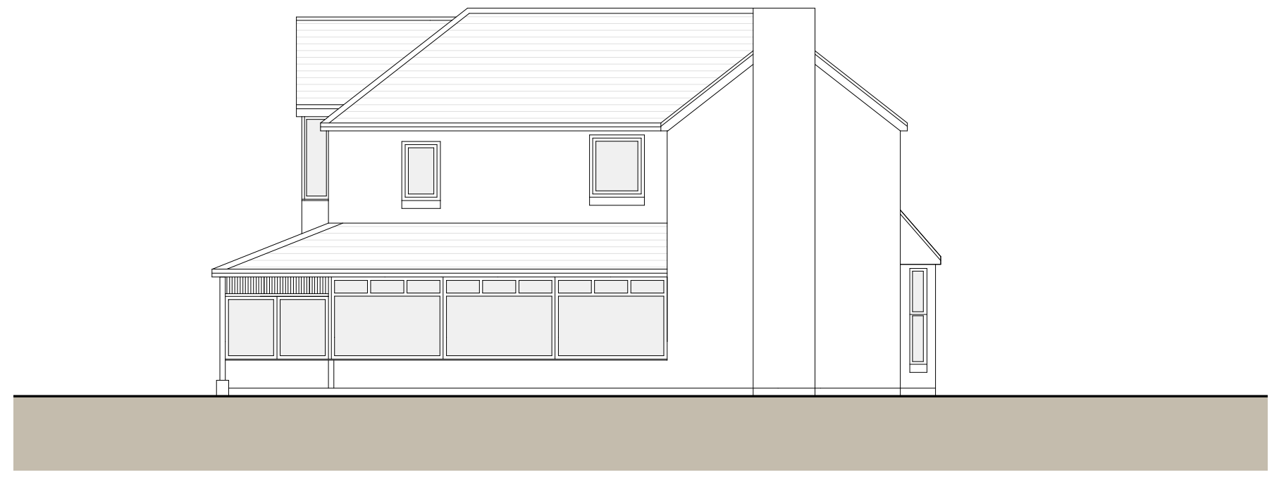
Side Elevation (south)