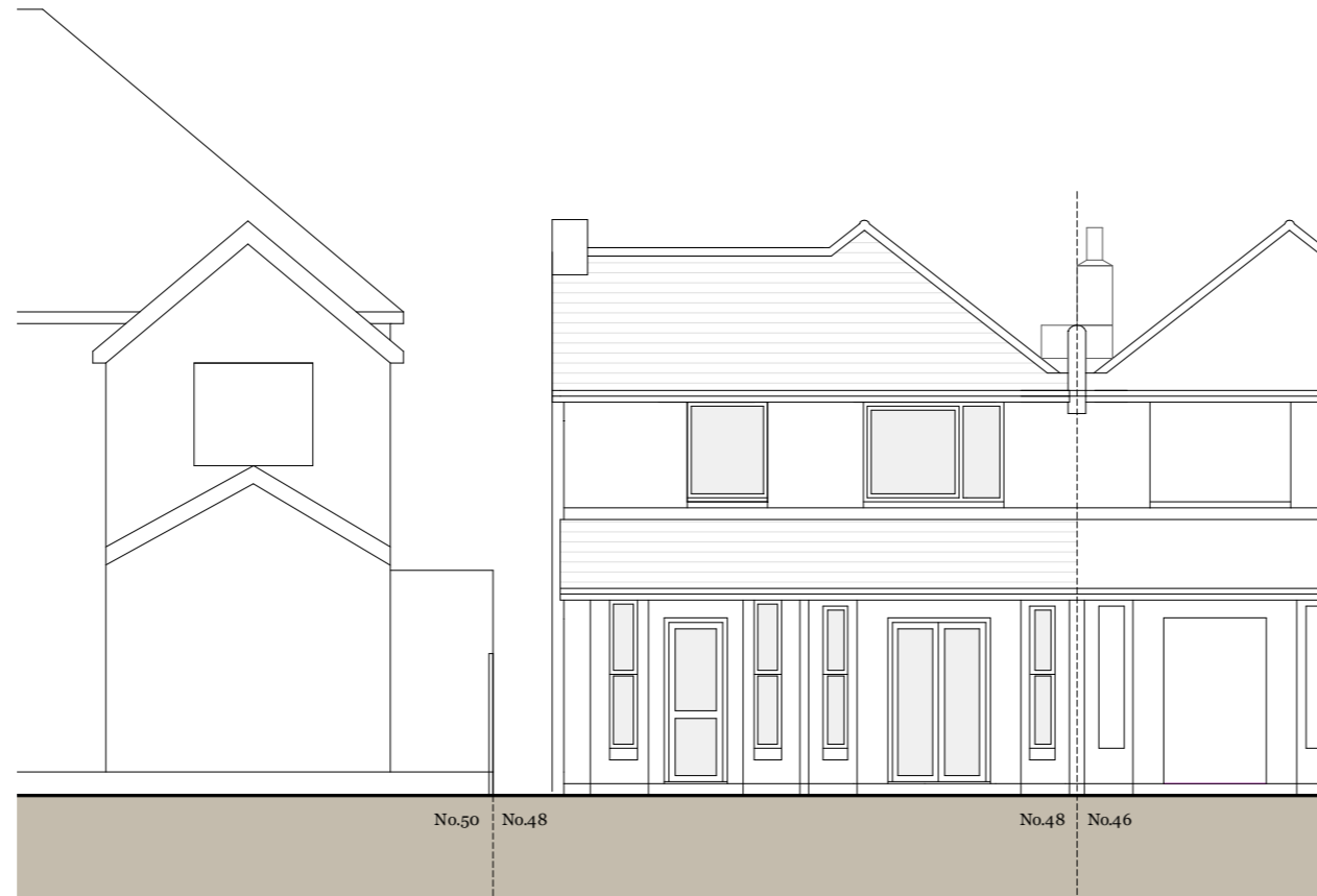
Rear Elevation (west)