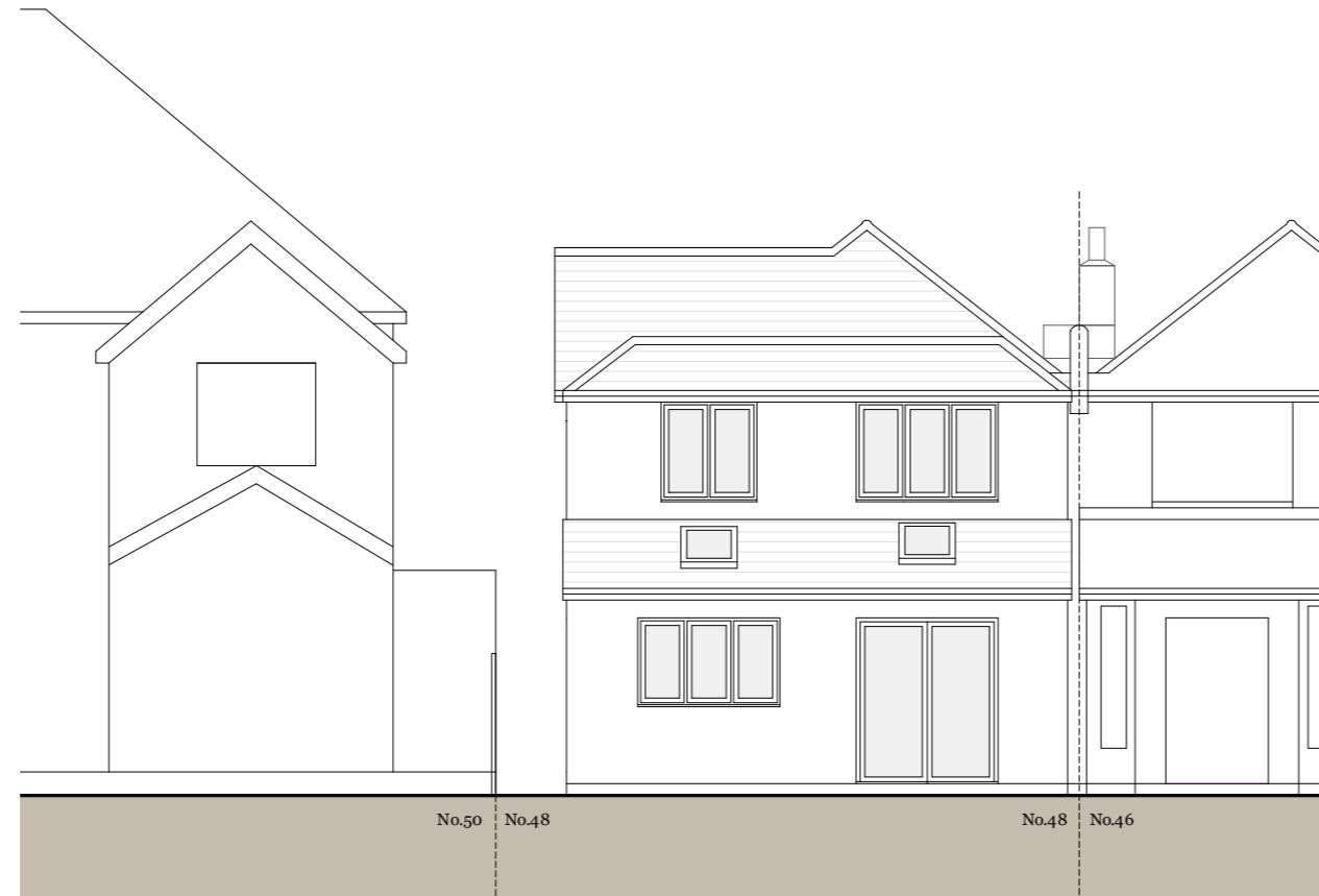
Rear Elevation (west)