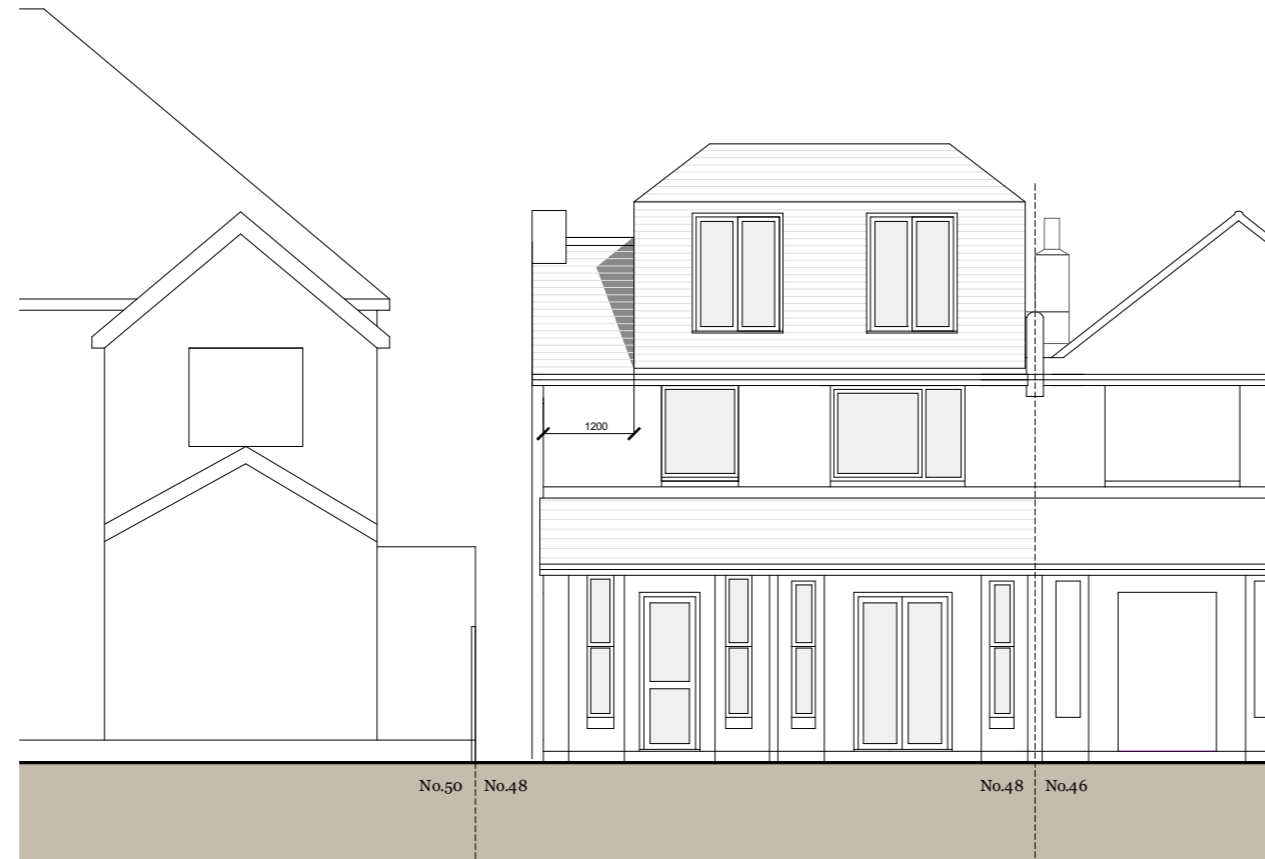
Rear Elevation (west)