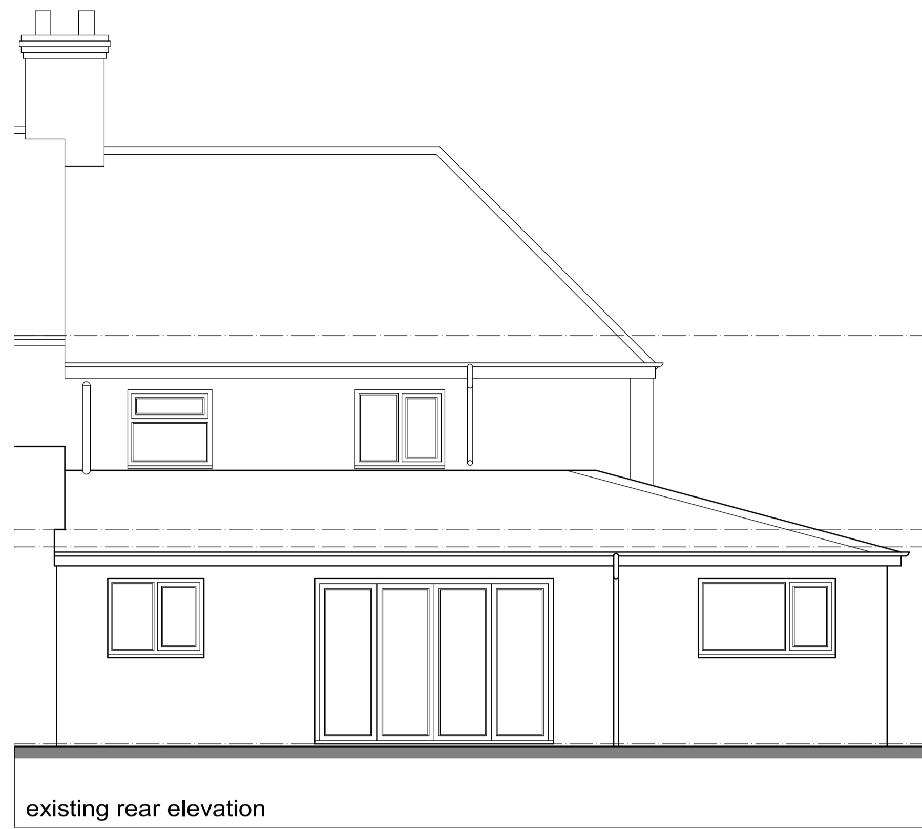
existing rear elevation