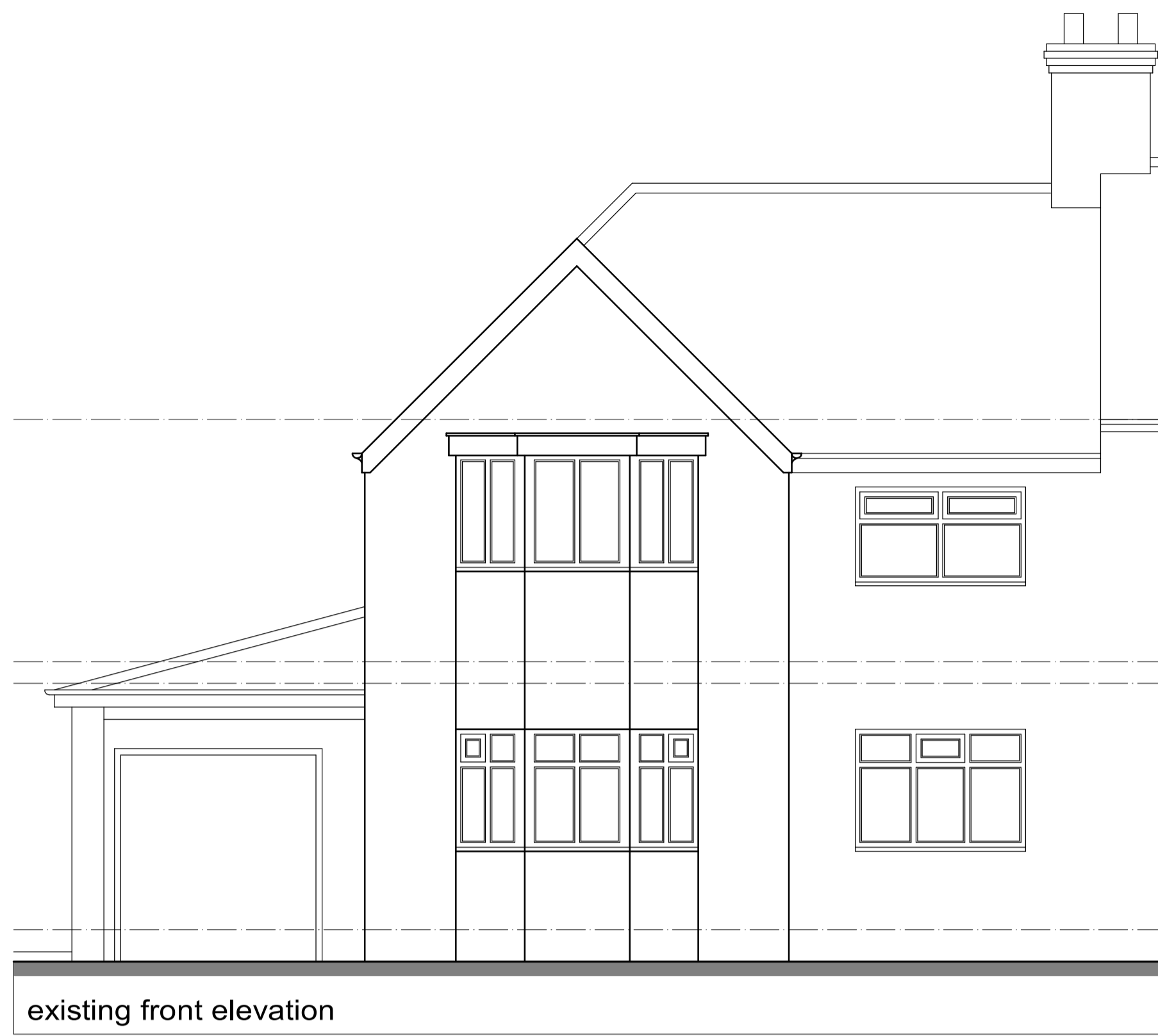
existing front elevation