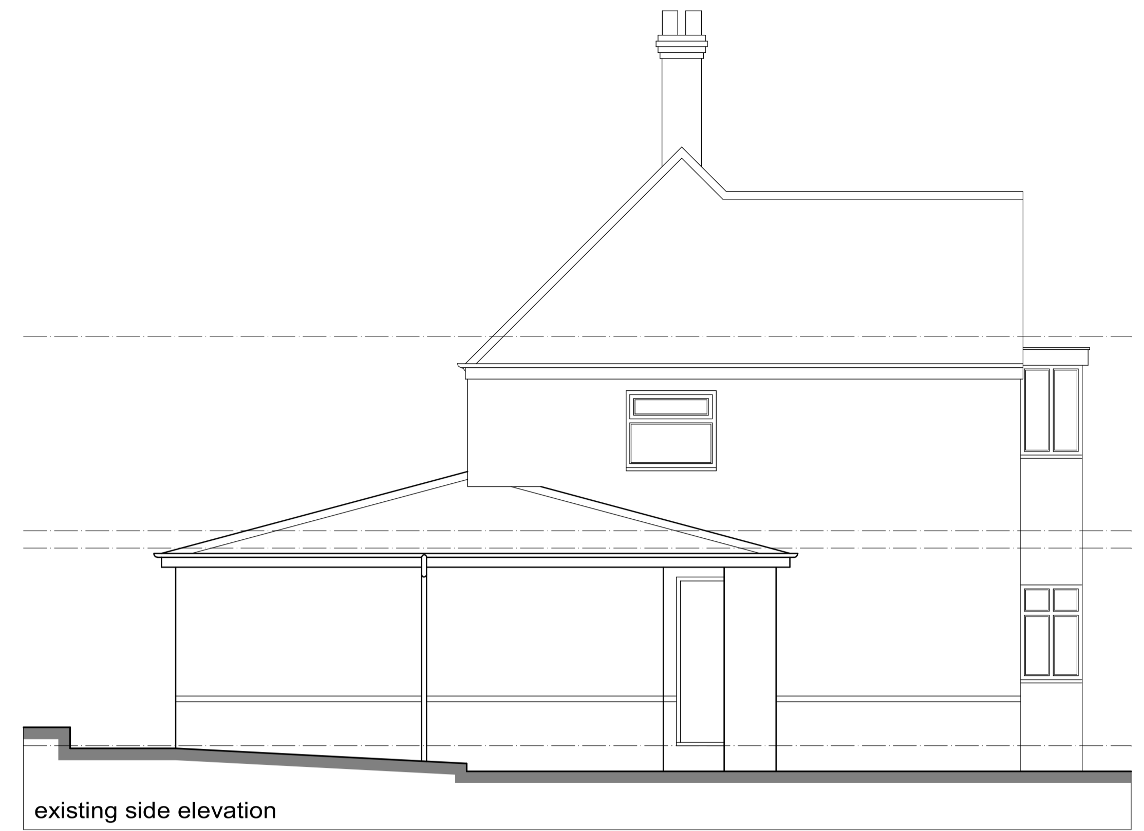
existing side elevation