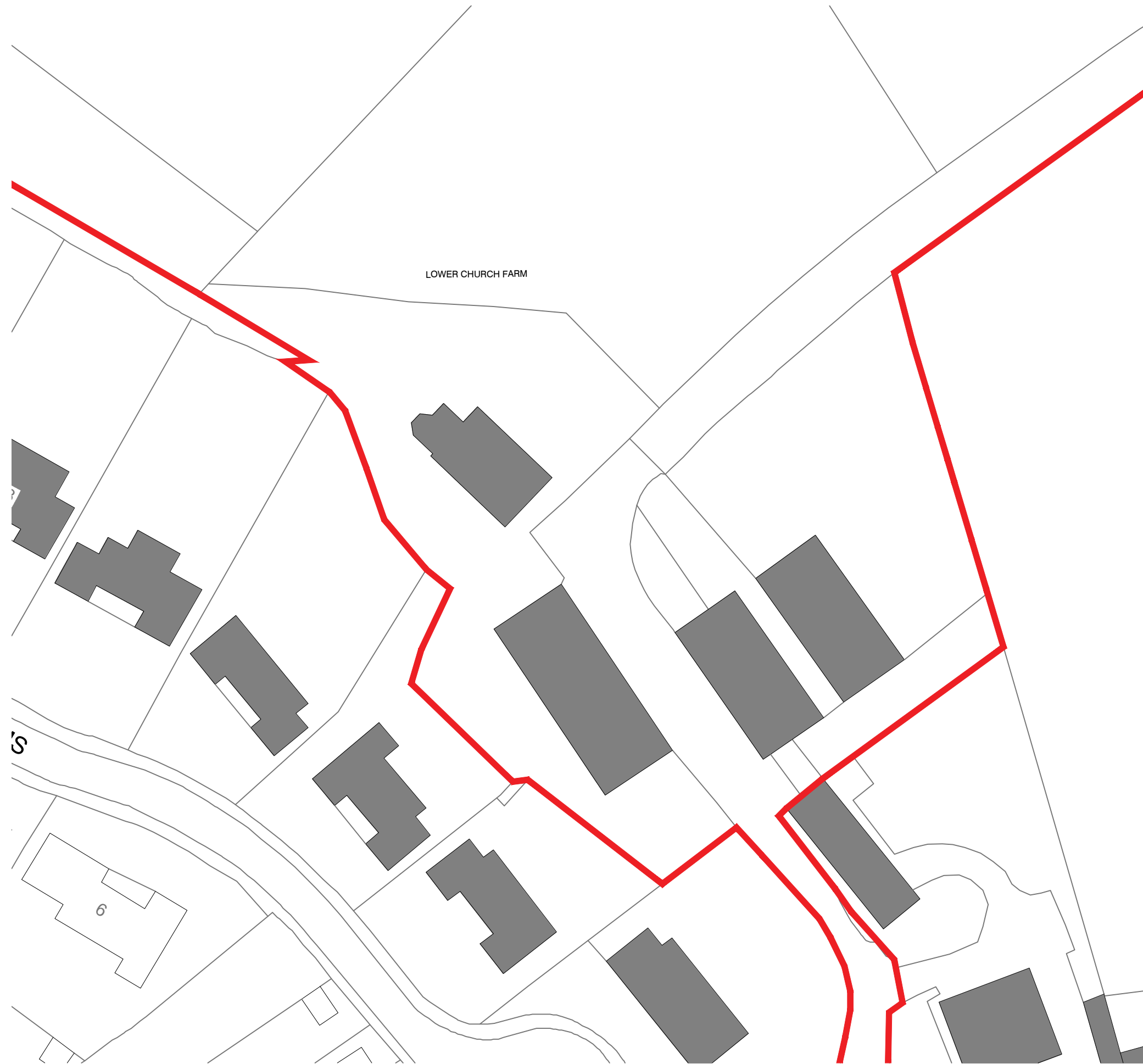
BLOCK PLAN 1:500