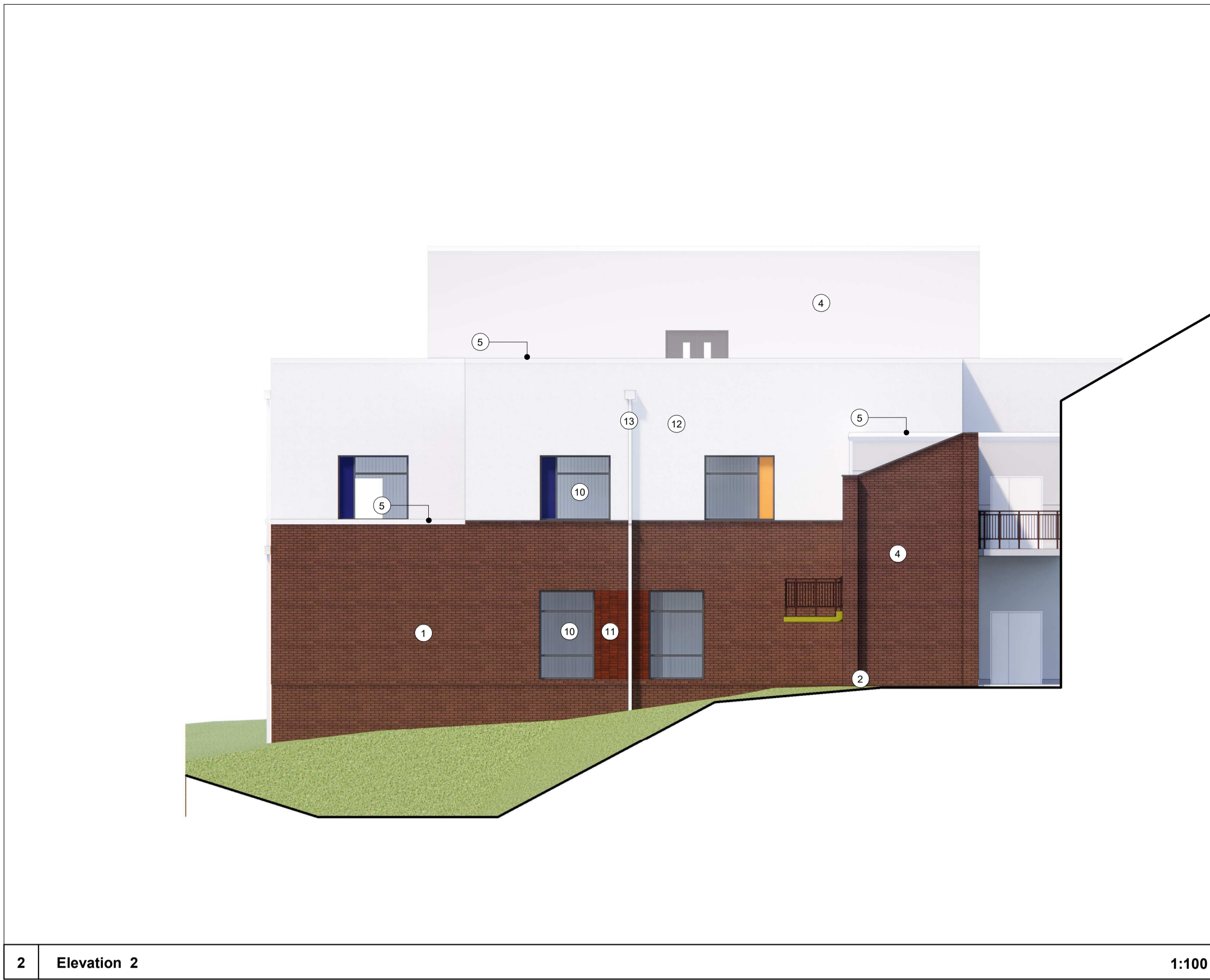
2 Elevation 2 1:100