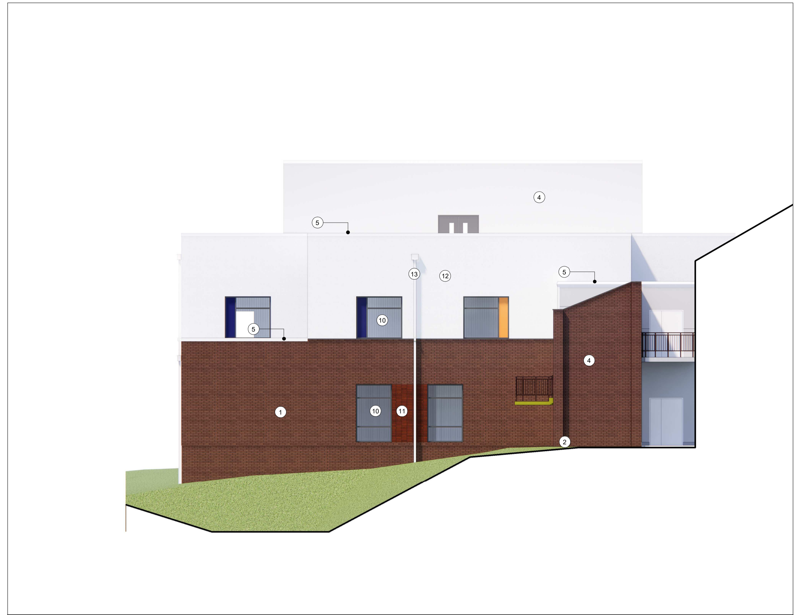
2 Elevation 2 1:50