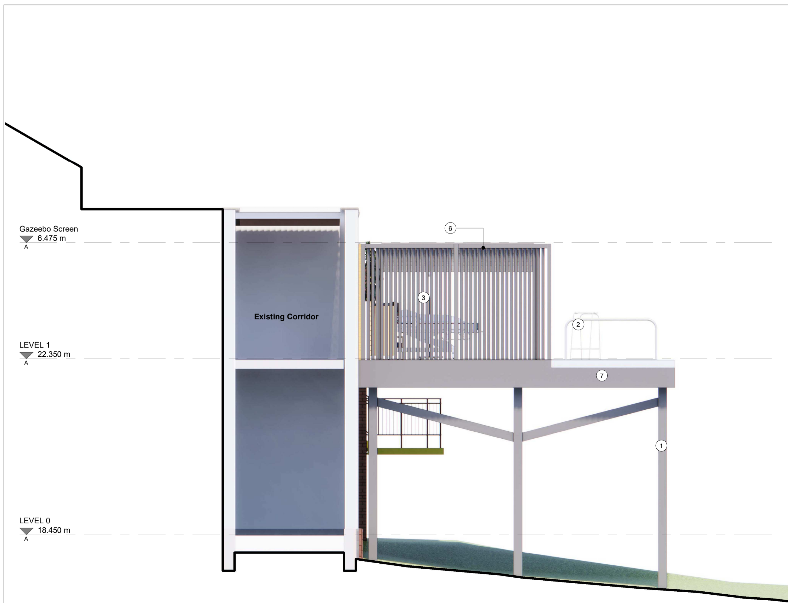
3 North Elevation 1:50