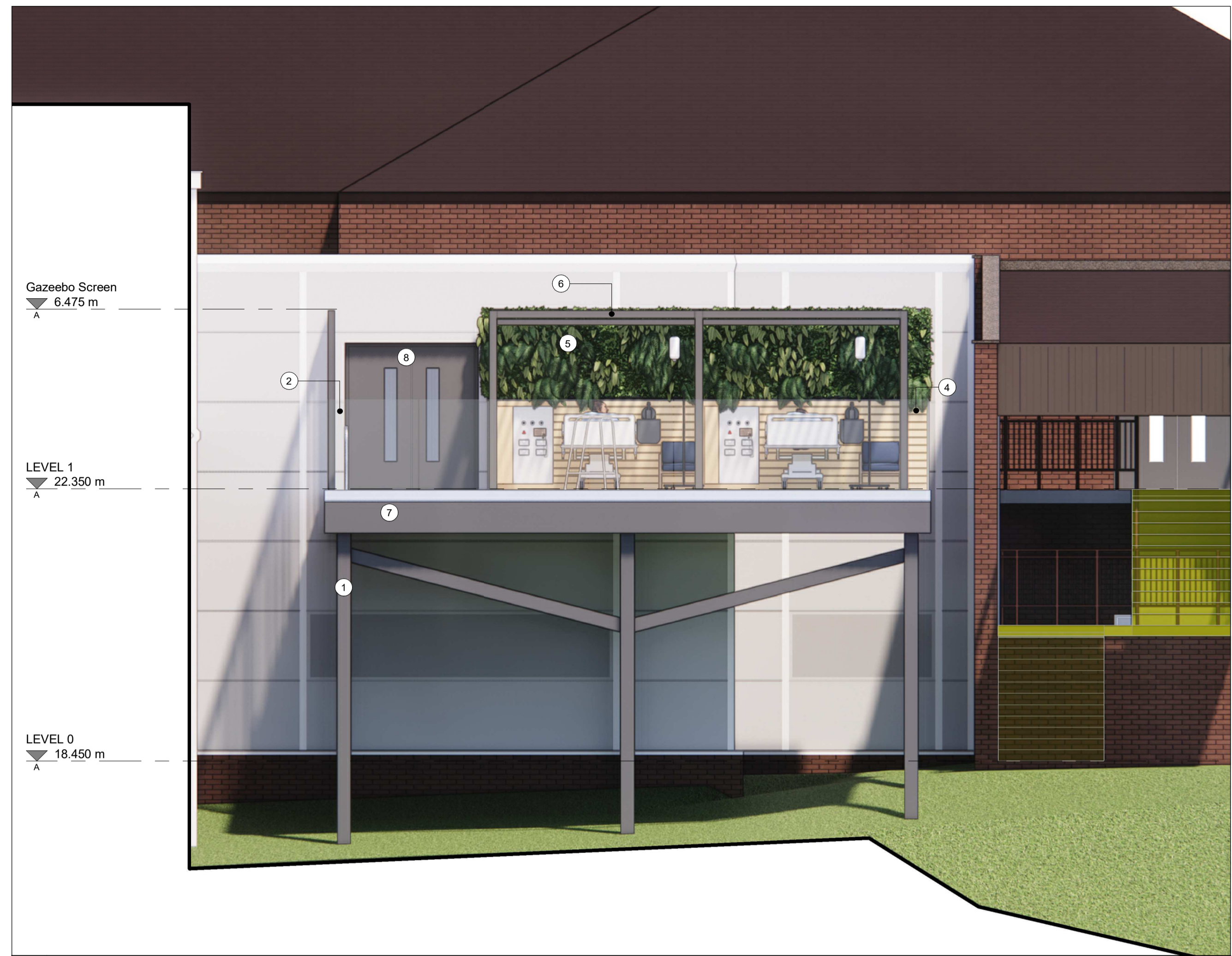
2 West Elevation 1:50