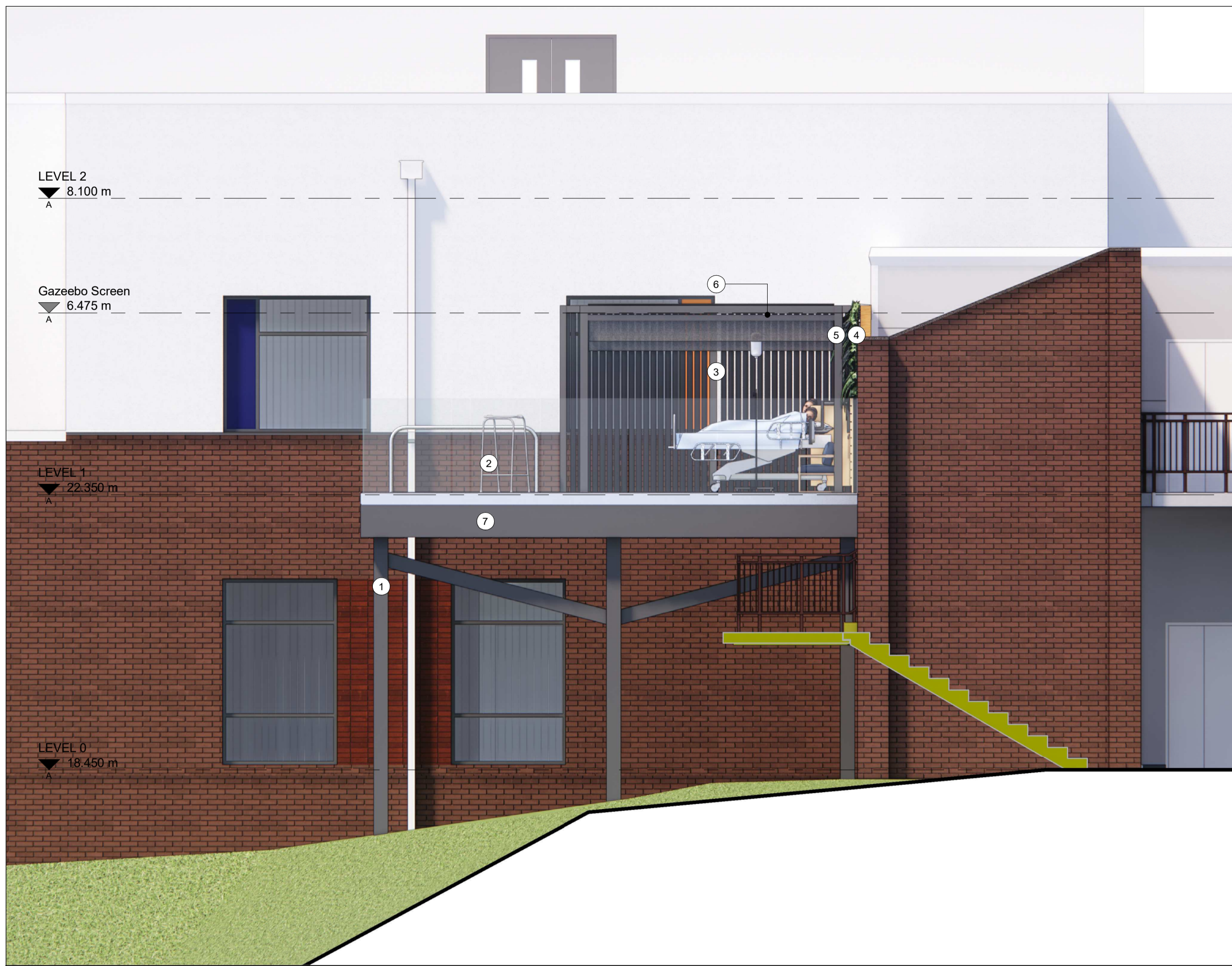
1 South Elevation 1:50