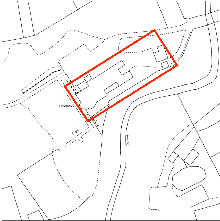
Ormiston House, Kirknewton