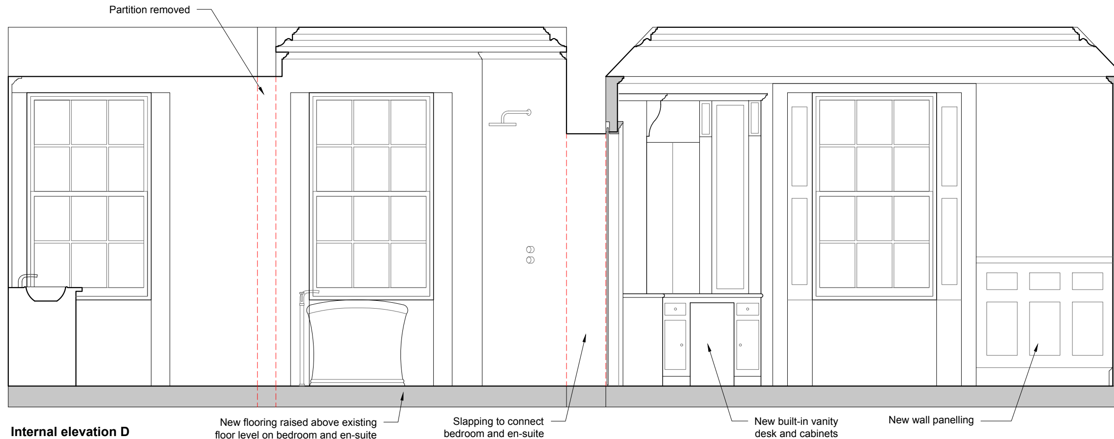
Internal elevation D