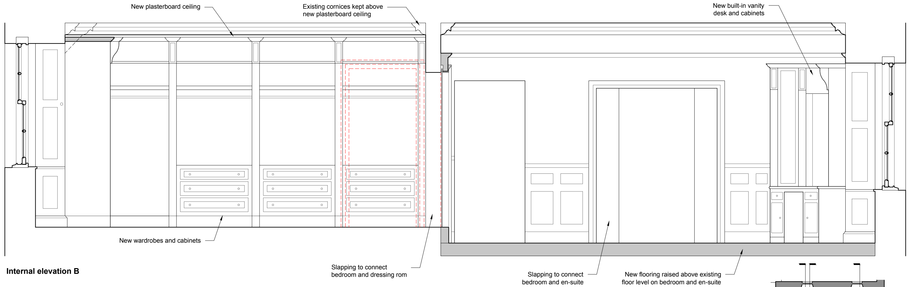
Internal elevation B