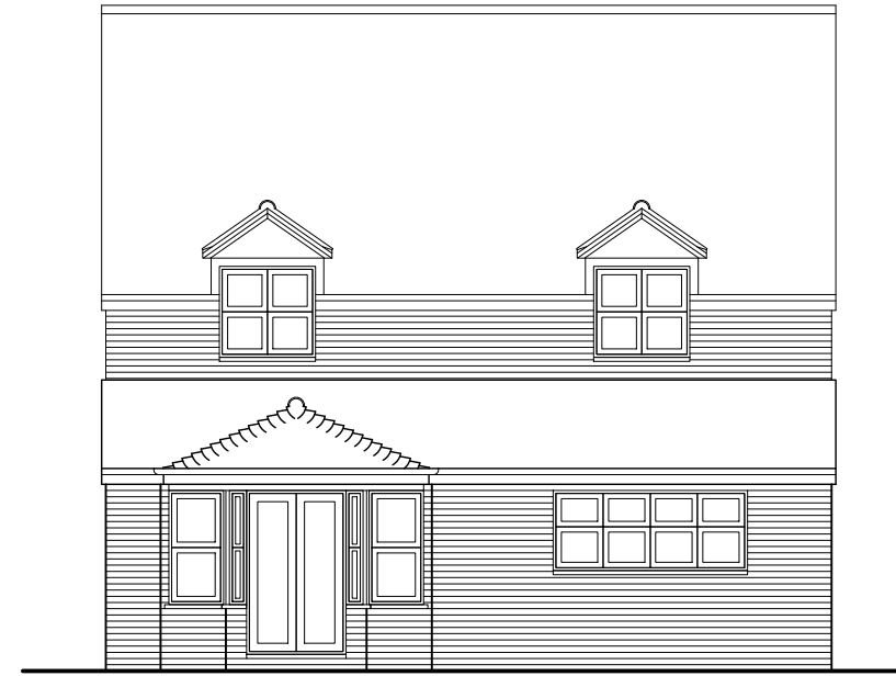
rear - east