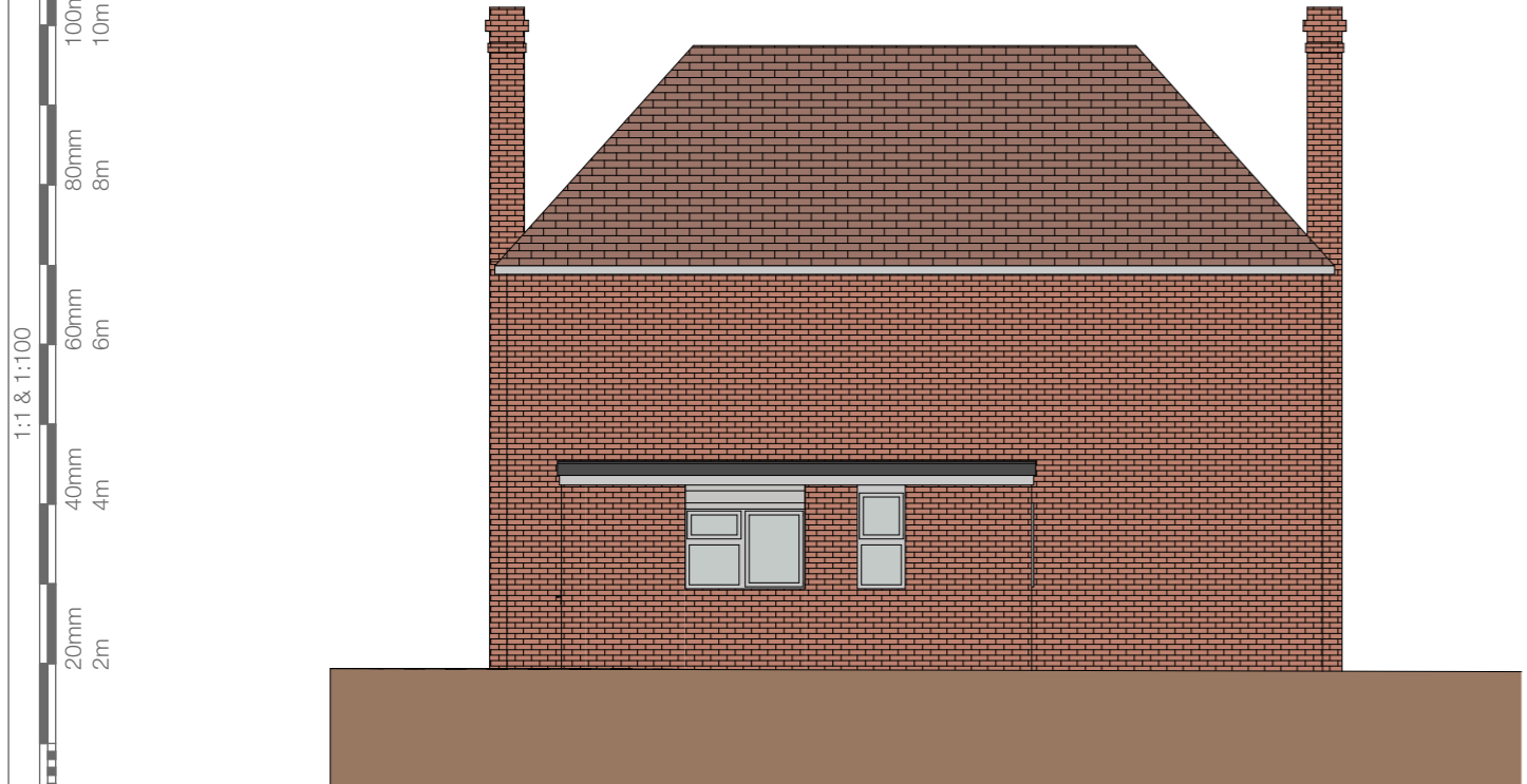
Existing Side Elevation 1:100