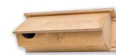
Swift nesting box