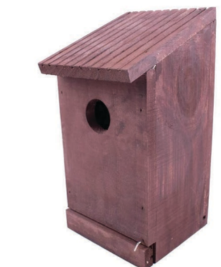
Small bird box for sparrows, house martins etc.,