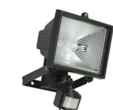
400W Halogen Security light with motion PIR sensor