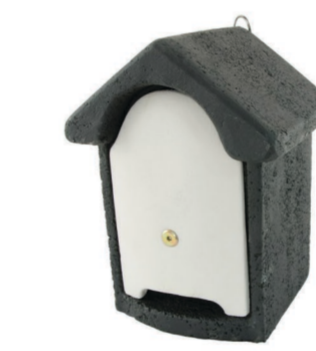
Woodcrete bat box