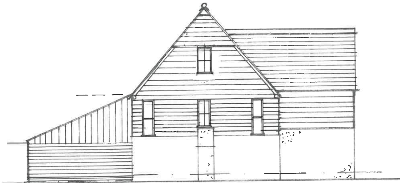
SIDE ELEVATION (SOUTH-WEST)