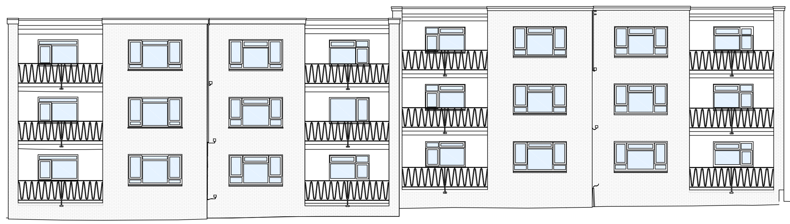
Elevation A - B Arbitrary Datum 45.00m