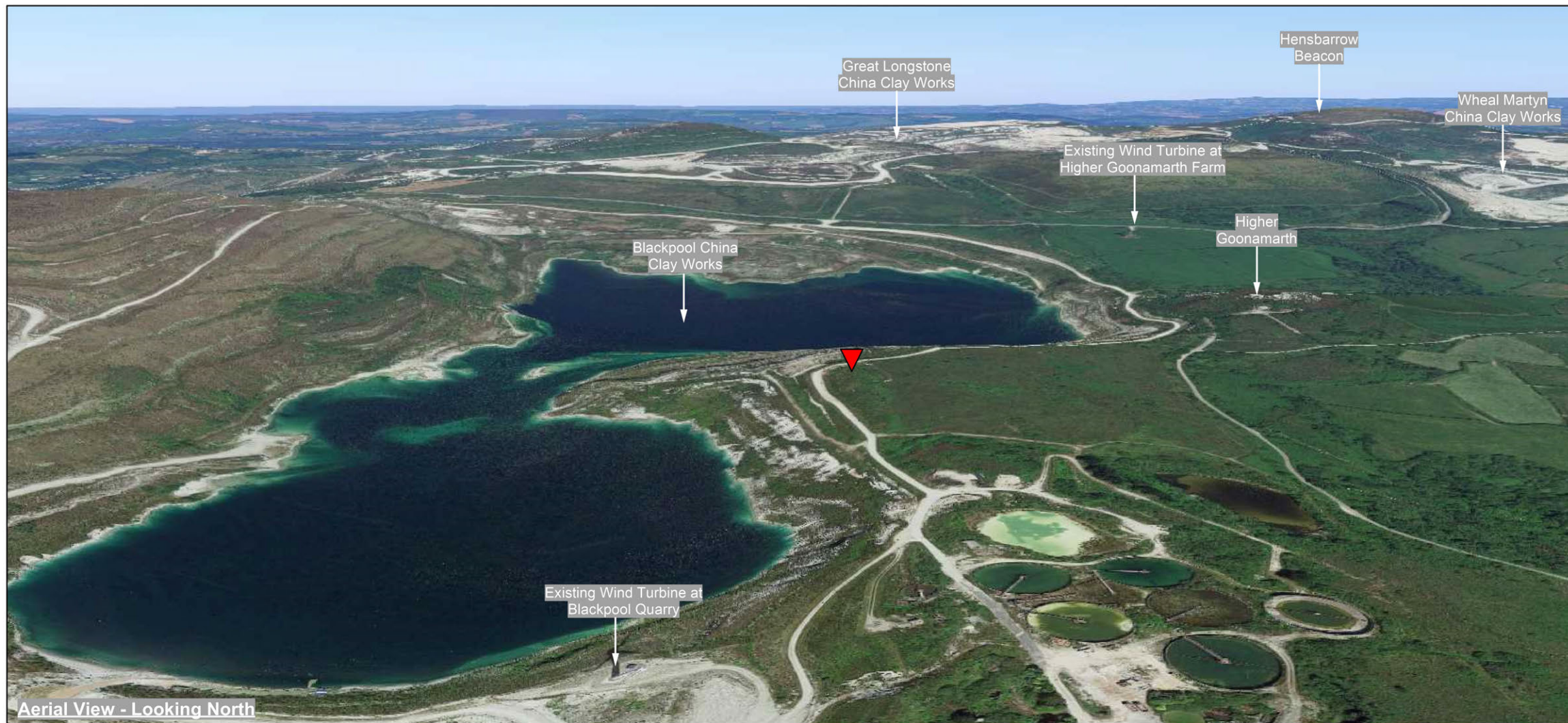
Aerial View - Looking North