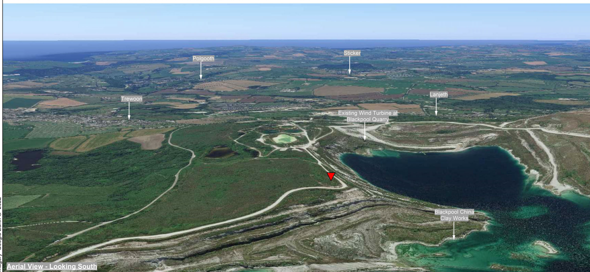
Aerial View - Looking South