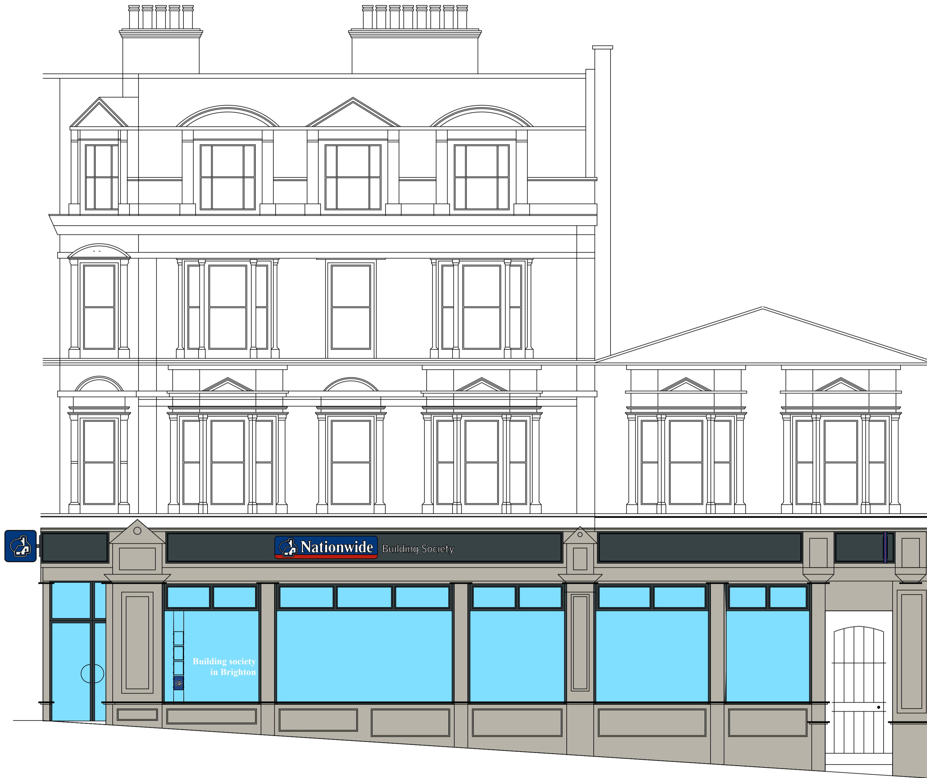
WEST STREET ELEVATION

ALL DIMENSIONS MUST BE CHECKED ON SITE. ONLY FIGURED DIMENSIONS ARE TO BE WORKED FROM. DISCREPANCIES MUST BE REPORTED TO THE ARCHITECT BEFORE PROCEEDING.