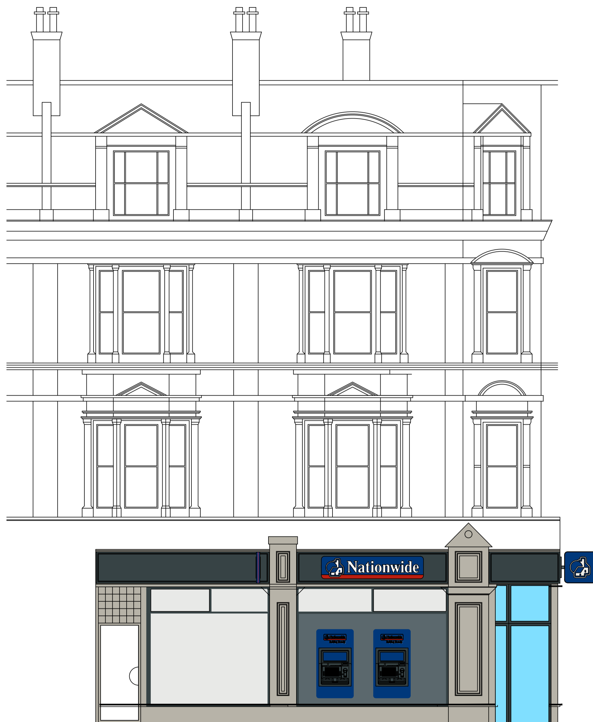
DUKE STREET ELEVATION

ALL DIMENSIONS MUST BE CHECKED ON SITE. ONLY FIGURED DIMENSIONS ARE TO BE WORKED FROM. DISCREPANCIES MUST BE REPORTED TO THE ARCHITECT BEFORE PROCEEDING.