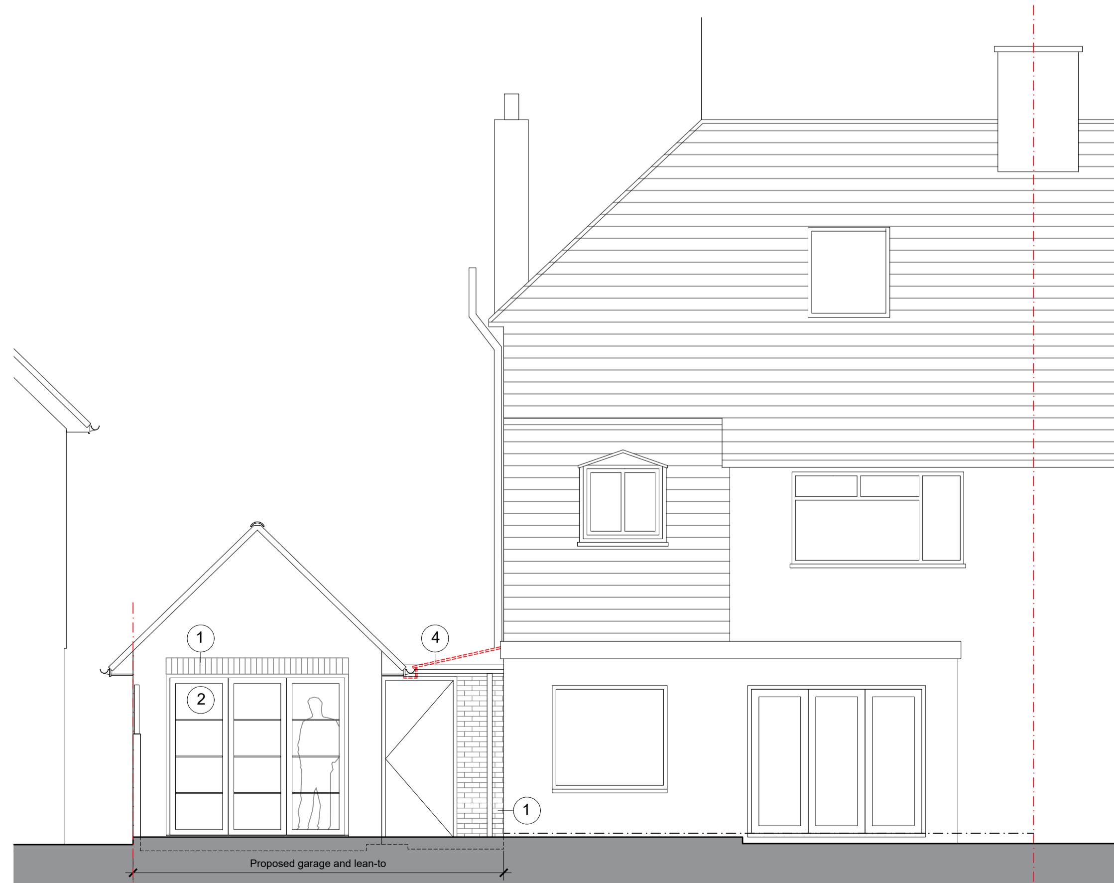
Proposed Rear Elevation @ 1:50