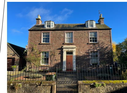
FRONT ELEVATION (South West)