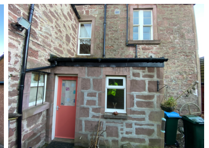
REAR ELEVATION (North East)