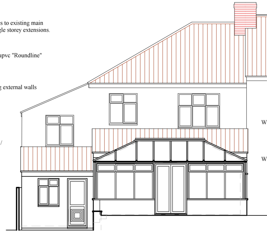
Existing west elevation scale 1:100

Dark brown clay double roman roof tiles to existing main house, side two storey and and rear single storey extensions. Dark brown upvc fascia & dark brown upvc "Roundline" rainwater gutter and downpipes. Render with spar stone finish to existing external walls with face brick plinth. Black aluminium double glazed sliding / folding external rear doors. White upvc part double glazed external rear entrance doors.