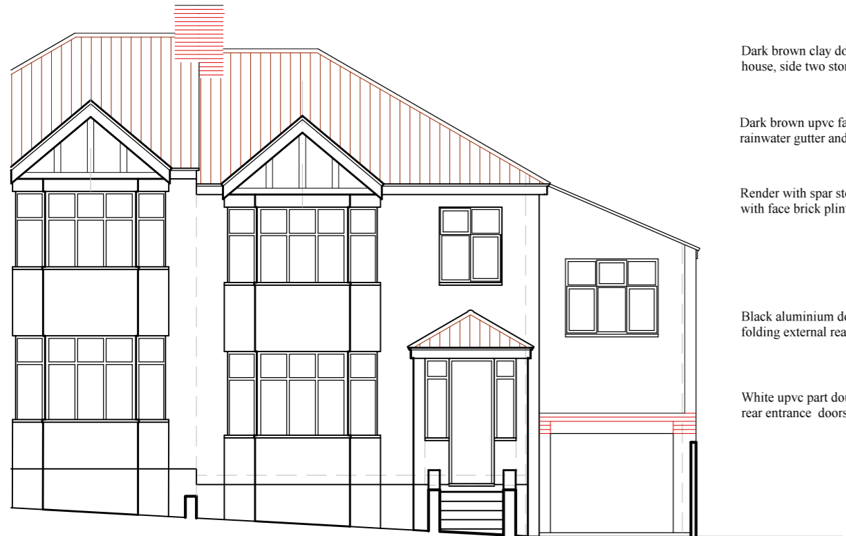
Existing east elevation scale 1:100

Dark brown clay double roman roof tiles to existing main house, side two storey and and rear single storey extensions. Dark brown upvc fascia & dark brown upvc "Roundline" rainwater gutter and downpipes. Render with spar stone finish to existing external walls with face brick plinth. Black aluminium double glazed sliding / folding external rear doors. White upvc part double glazed external rear entrance doors.