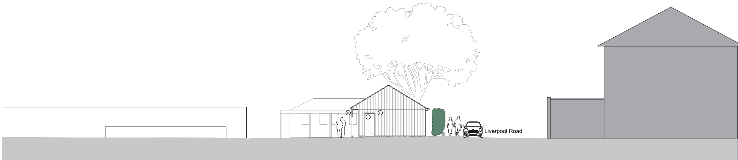
Section - Through Site and Liverpool Road