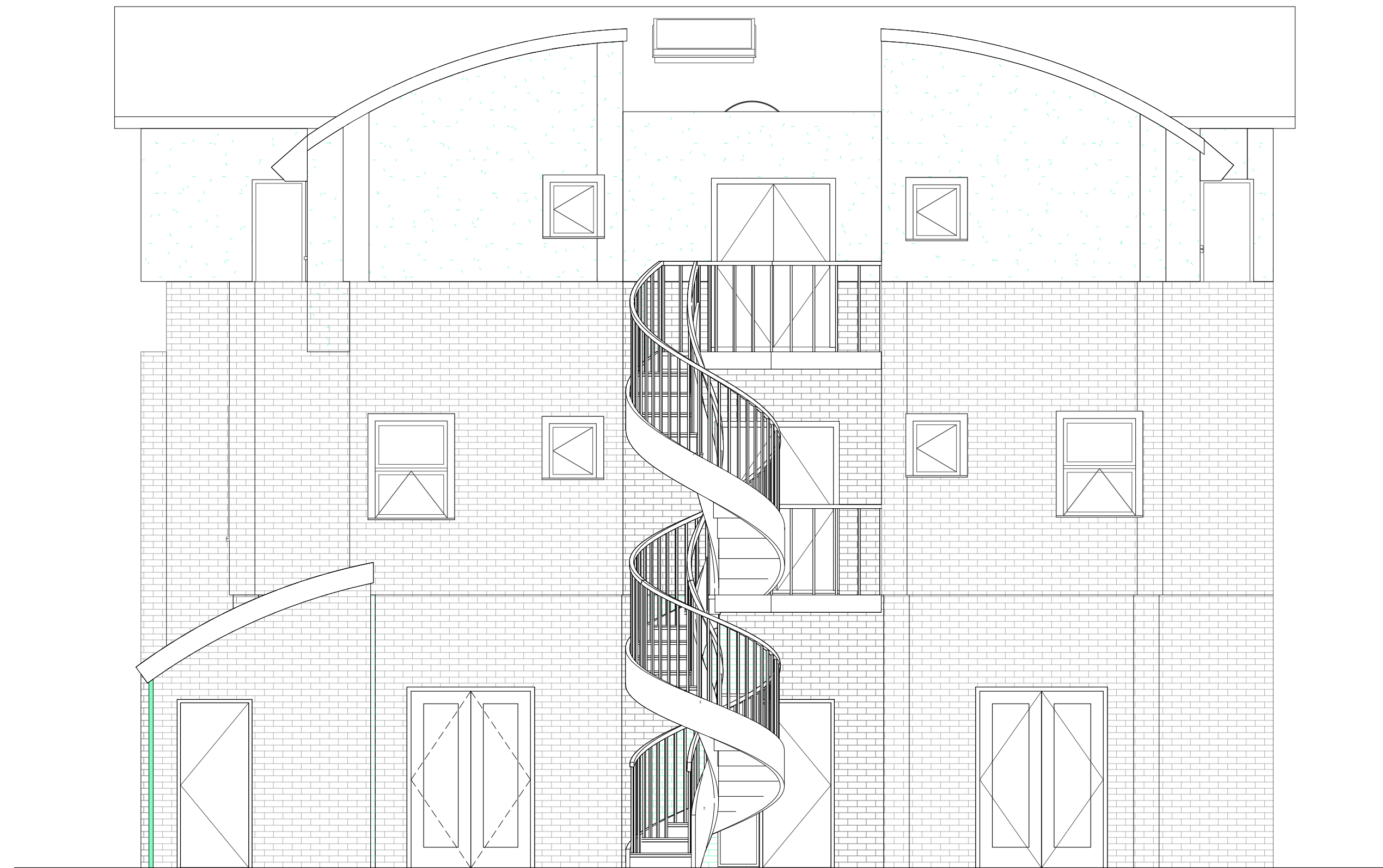
Rear Elevation - Existing (No change)

PROJECT ADDRESS 162 Gillett Road Thornton Heath, CR7 8SN