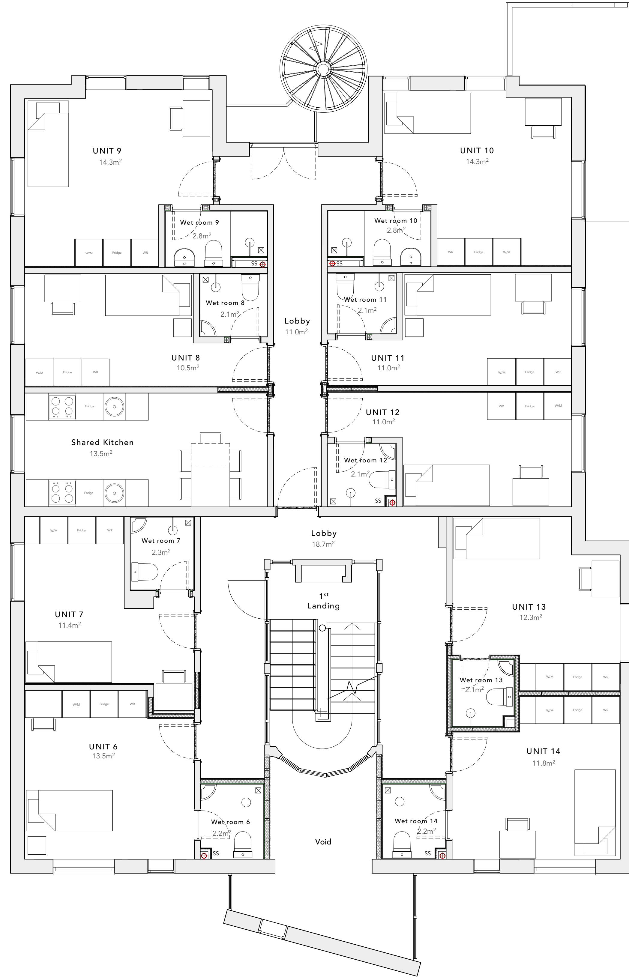
First Floor - Proposed 1:50 @ A1