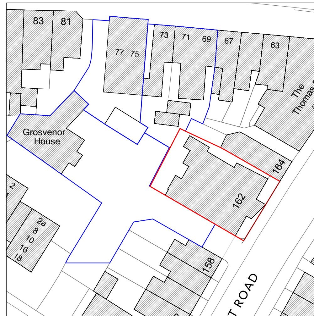
Block Plan 1:500 @A3