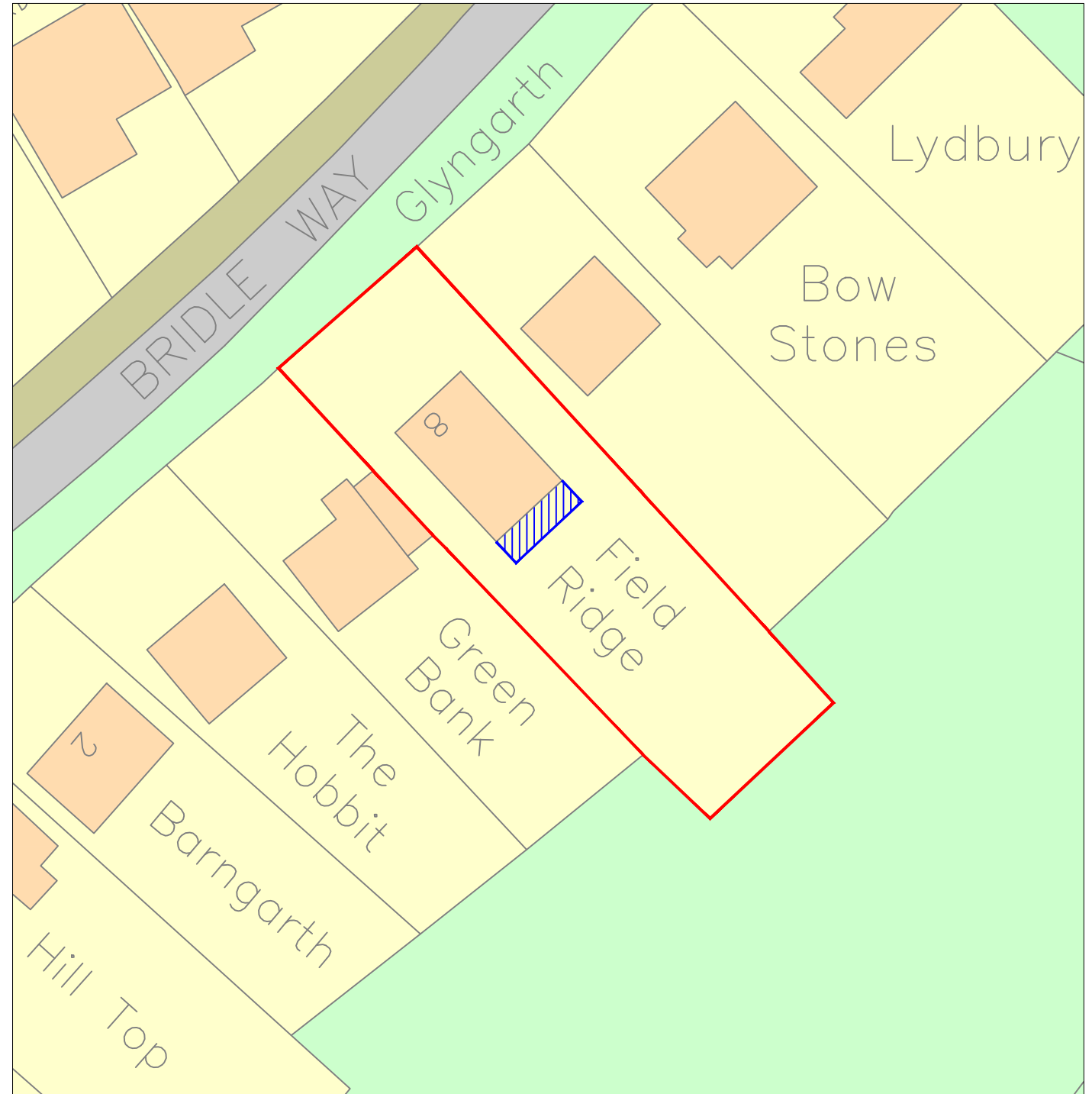
Location Plan Scale 1:500