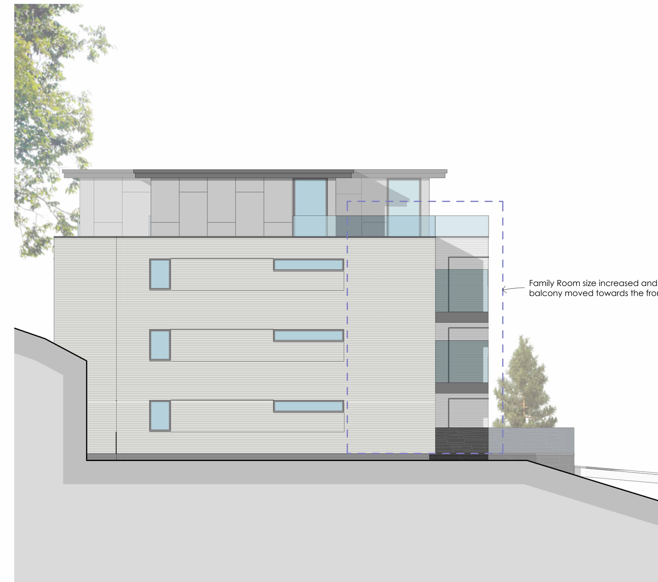
Side Elevation 2

NOTES Do not scale from drawing, figured dimensions to be used only All dimensions to be verified on site. Any discrepancies are to be reported to the relevant parties. The content of the drawing remain the copyright of Union Architecture, no reproduction without written consent