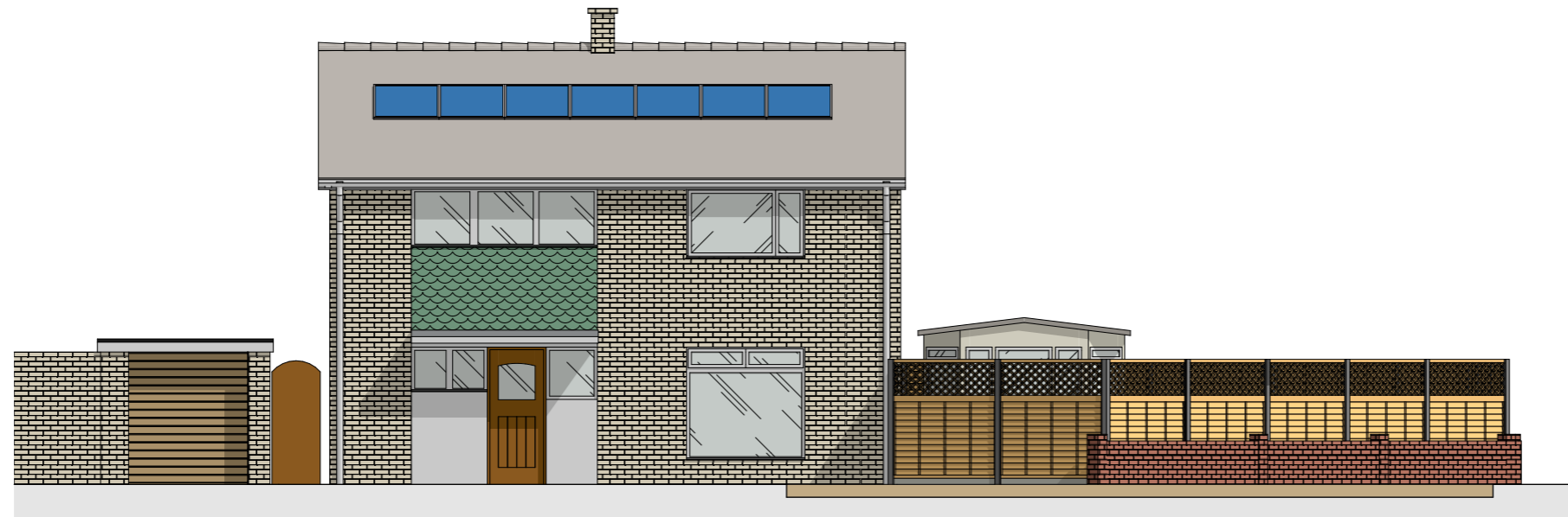
Proposed East Elevation | Scale 1:100