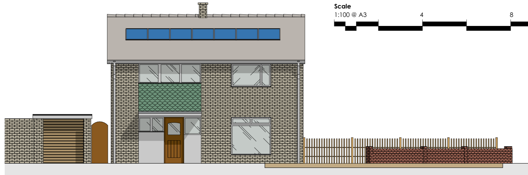
Existing East Elevation | Scale 1:100