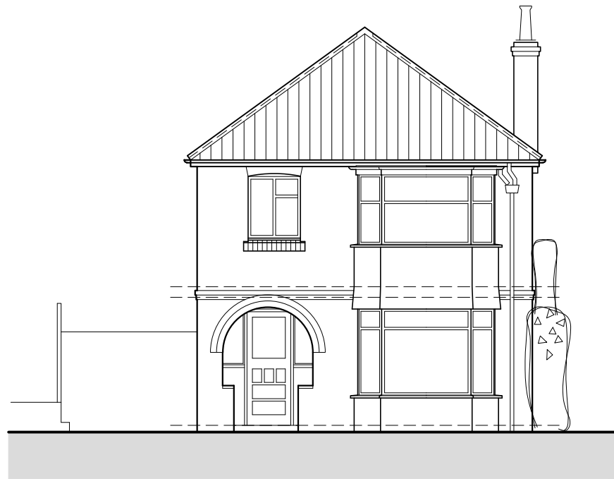
FRONT (WEST) ELEVATION