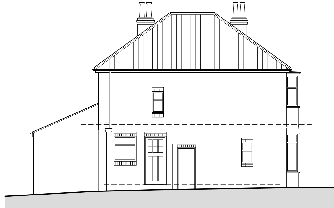
SIDE (NORTH) ELEVATION