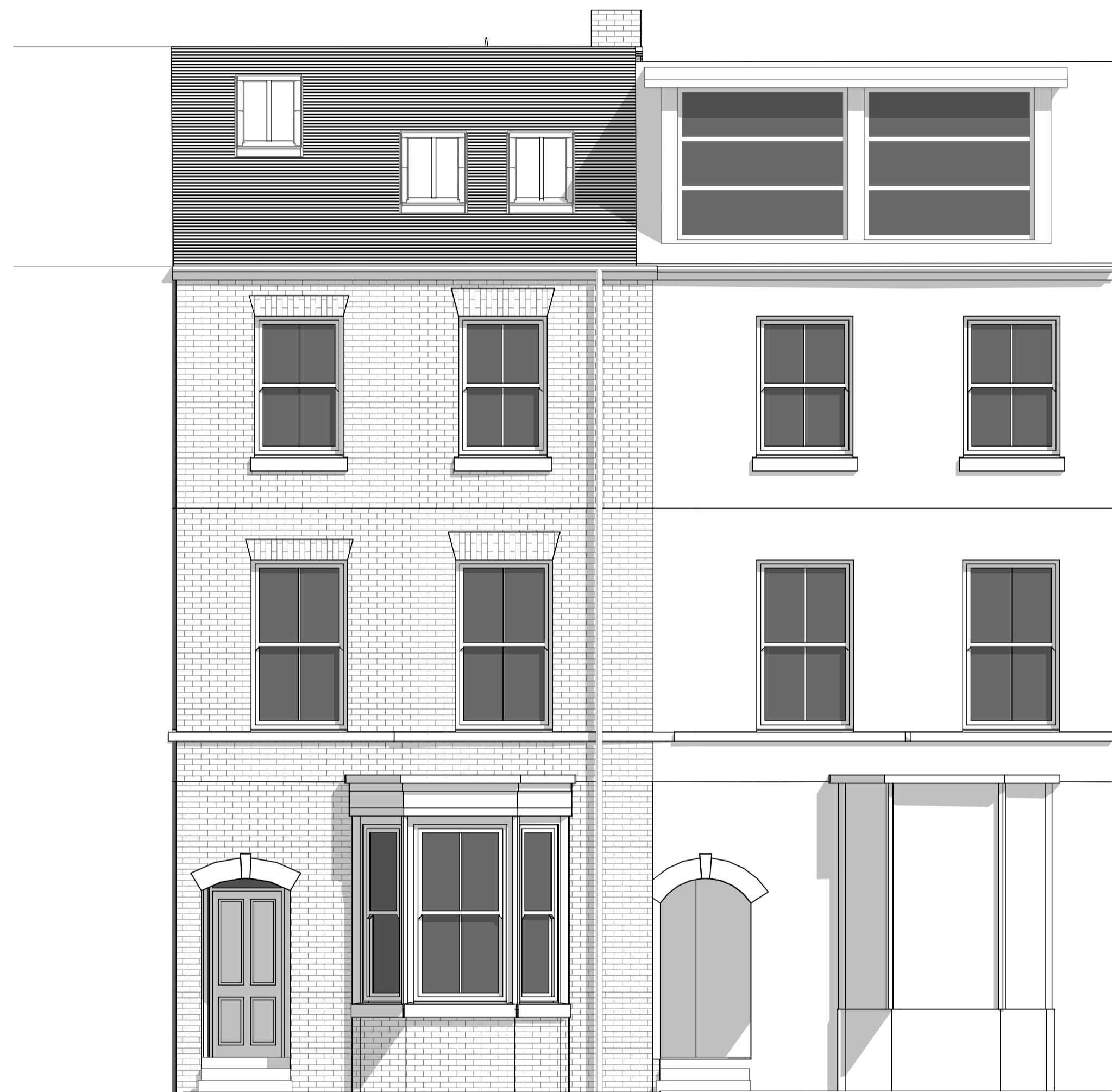
1 Elevation 1:50