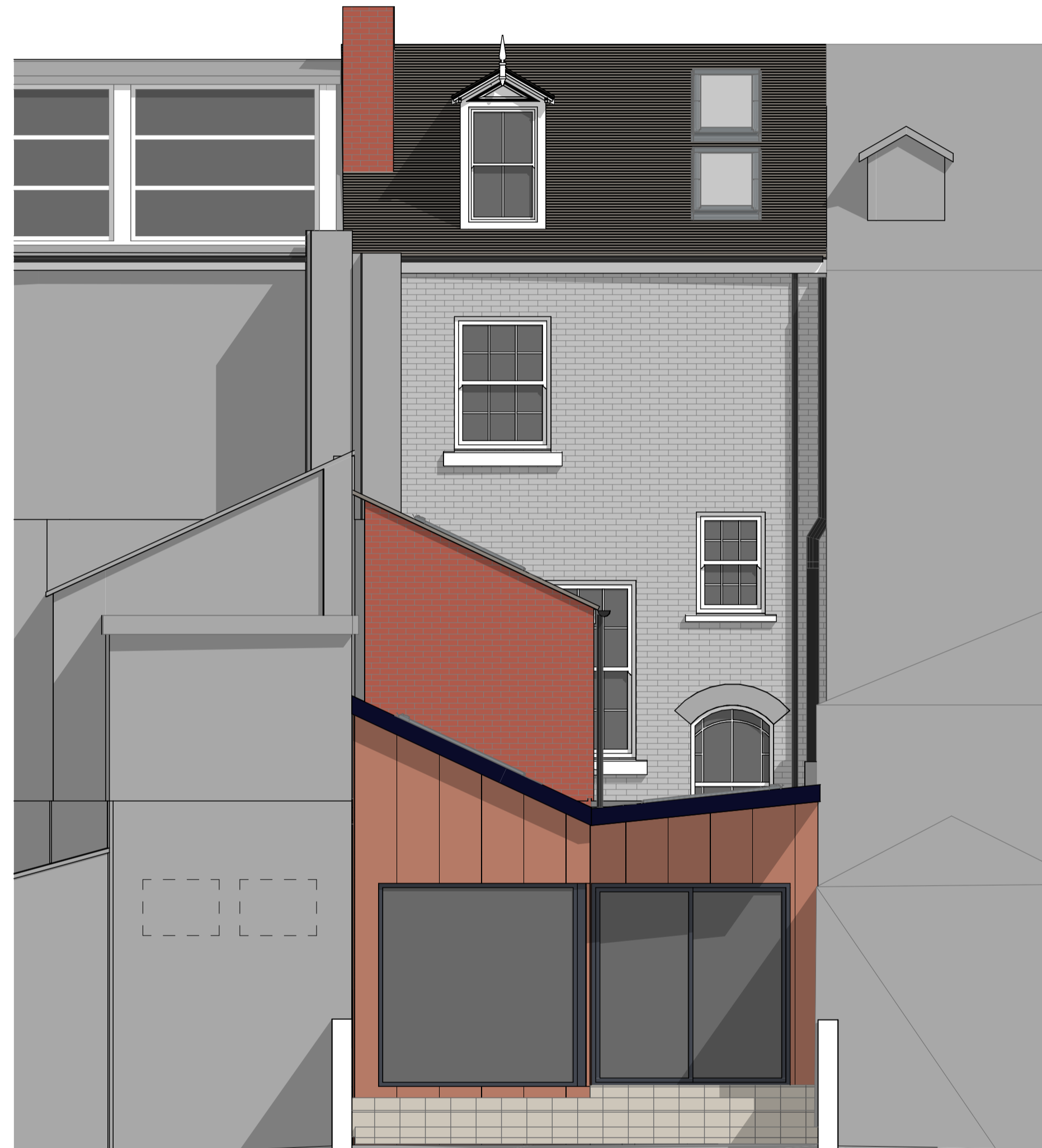
1 N.E Elevation 1:50